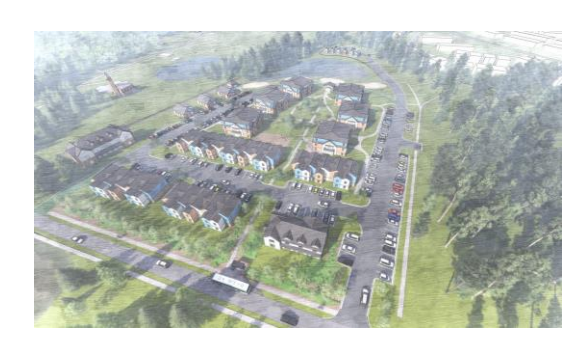
Spring 2018 Council Review of Concept Plan