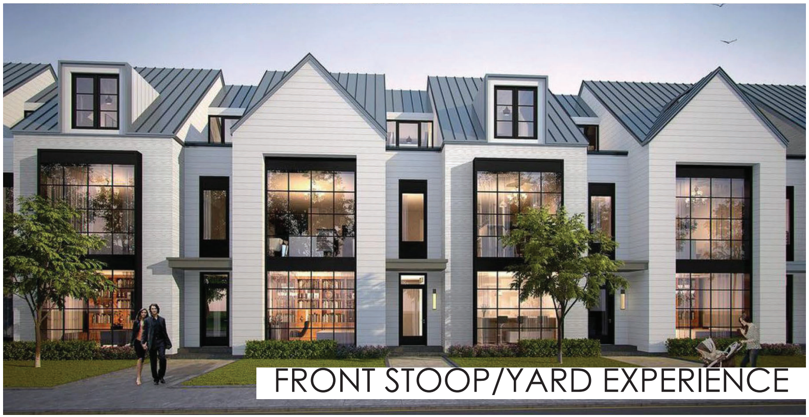
FRONT STOOP/YARD EXPERIENCE