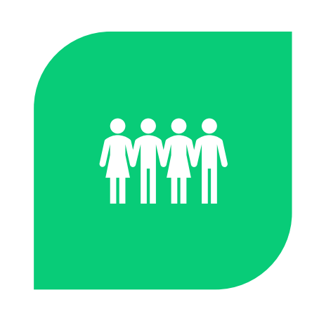
IDENTIFIED COMMUNITY PARTNERS