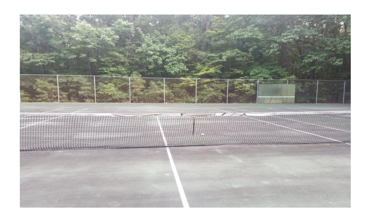
Ephesus Park - Courts