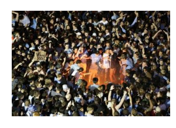
A D D P E O P L E - Private office workers with reasonable wages to support downtown businesses....