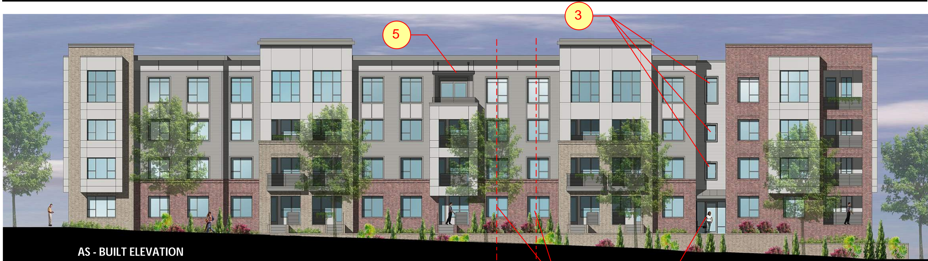
AS - BUILT ELEVATION