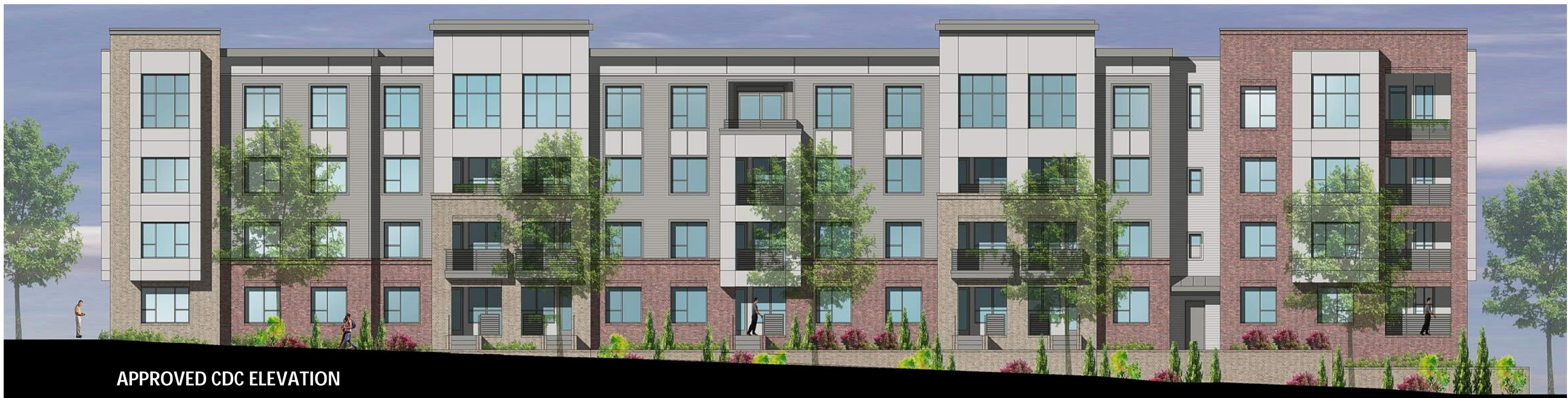
APPROVED CDC ELEVATION