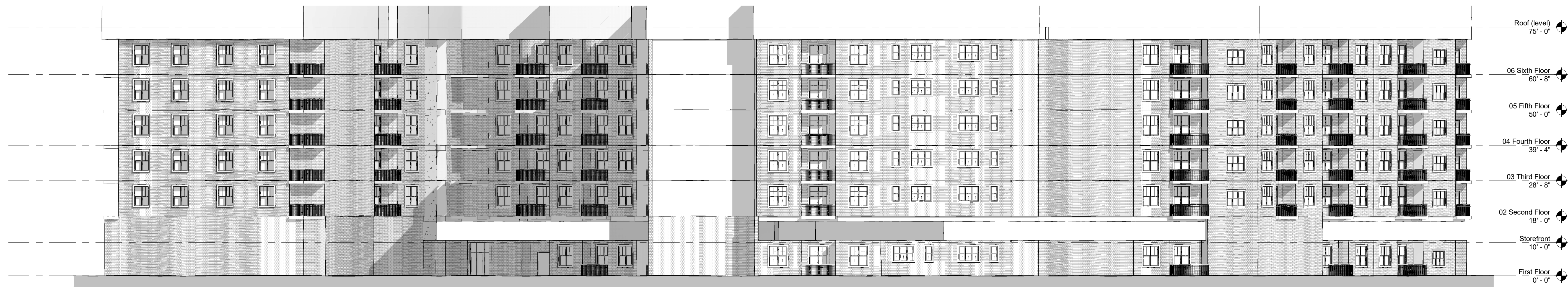
ELEVATION-LEGION EXT 3 1/16" = 1'-0"