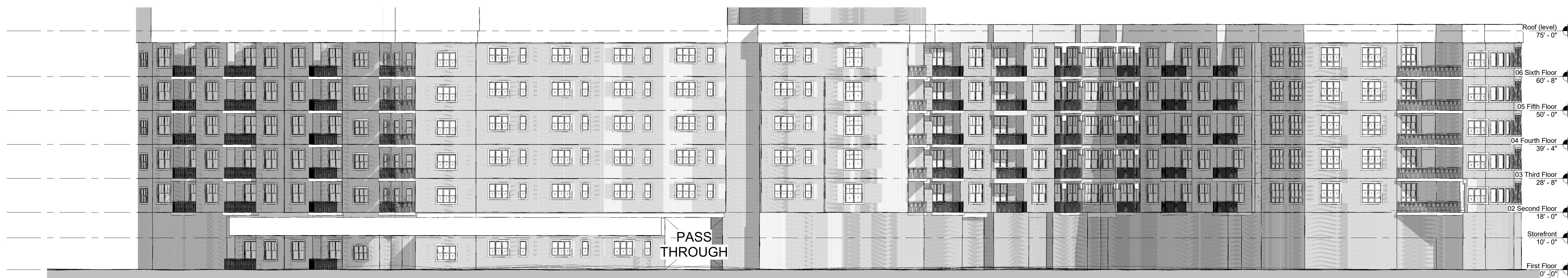
ELEVATION-EPHESUS 2 1/16" = 1'-0"