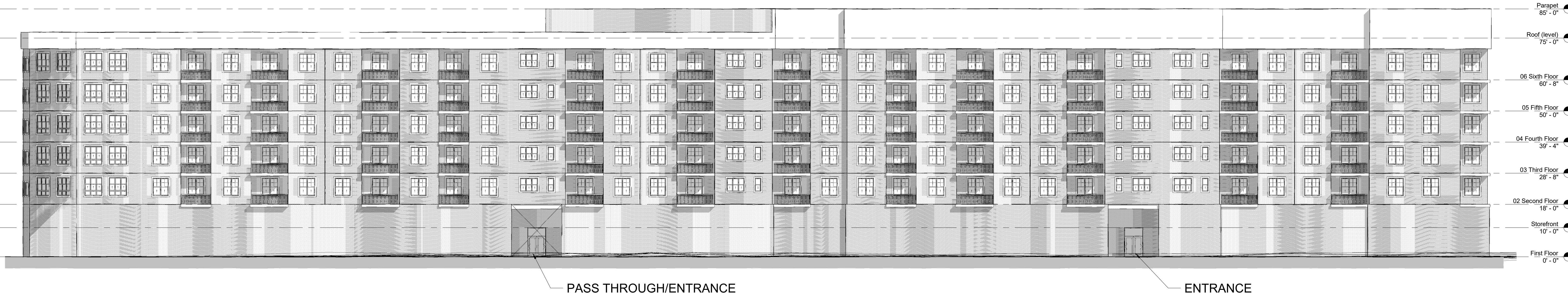
ELEVATION-FORDHAM BLVD 1 1/16" = 1'-0"