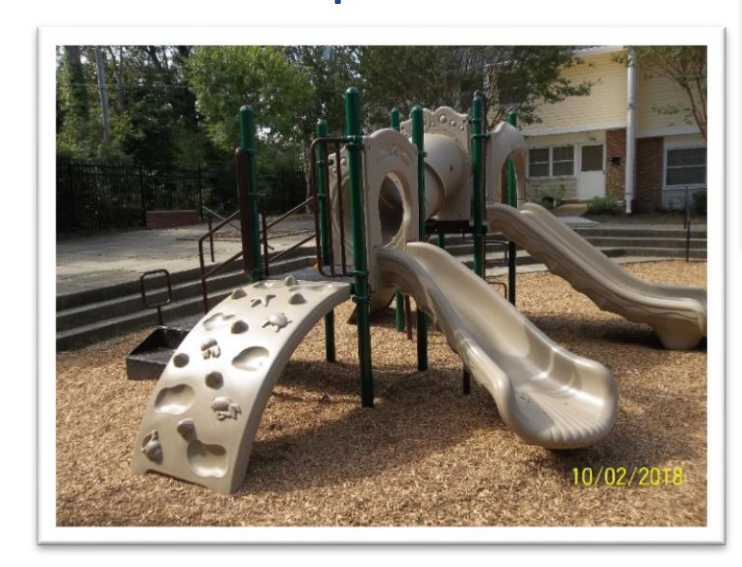
Public Facilities Improvements