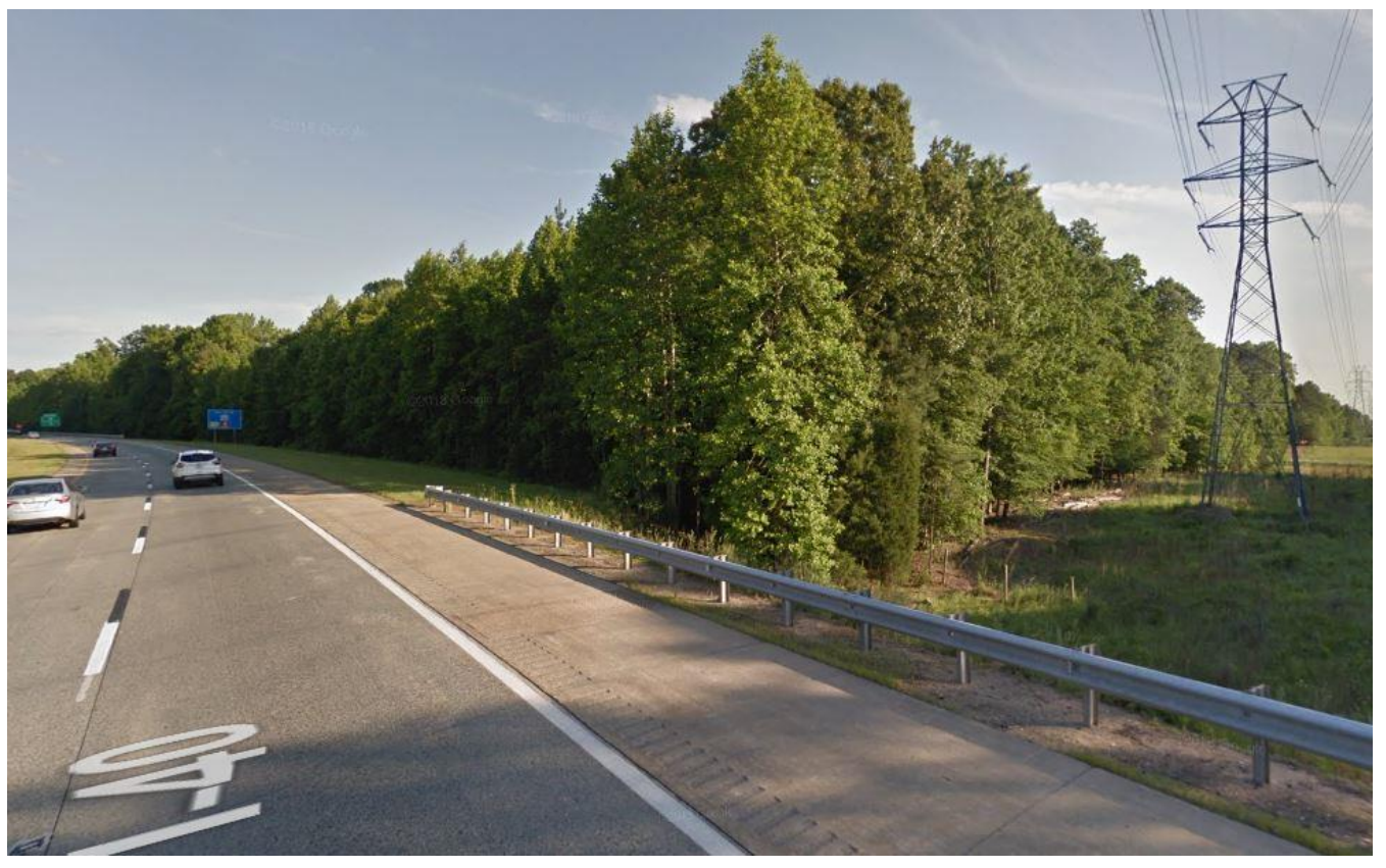
View toward the site from I-40 will remain approximately as it currently exists