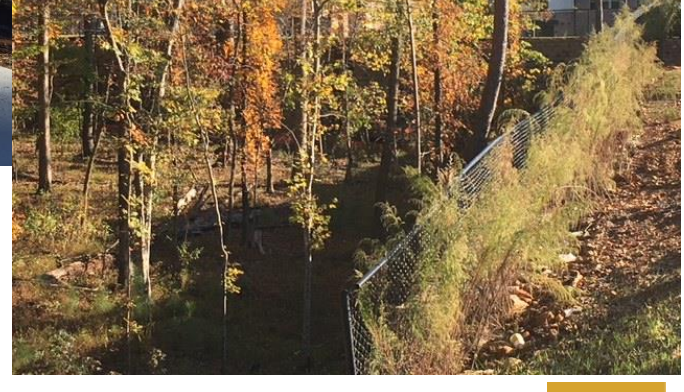
Existing road into project parcel

Retaining wall between project parcel and Carraway Village apartments