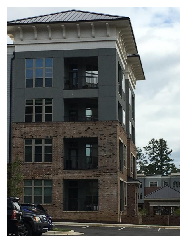
Existing Carraway Village architecture

Proposed climate controlled self storage facility: