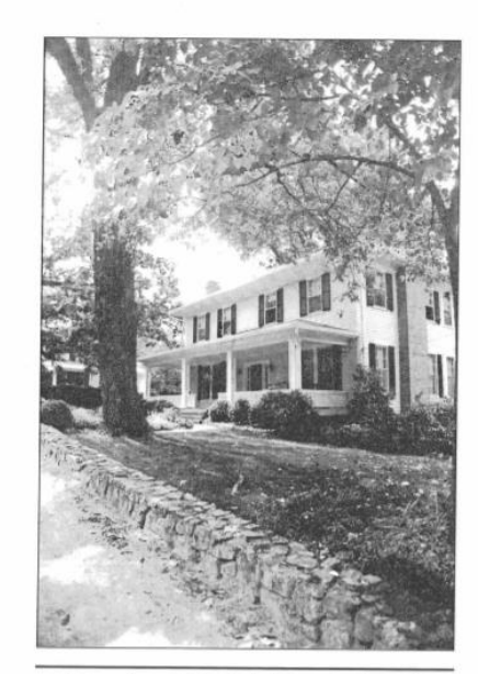
Design Guidelines for the Chapel Hill Historic Districts