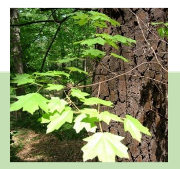
Tree & Natural Area Protection