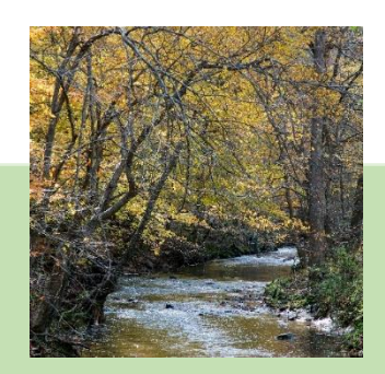
Water Conservation & Protection