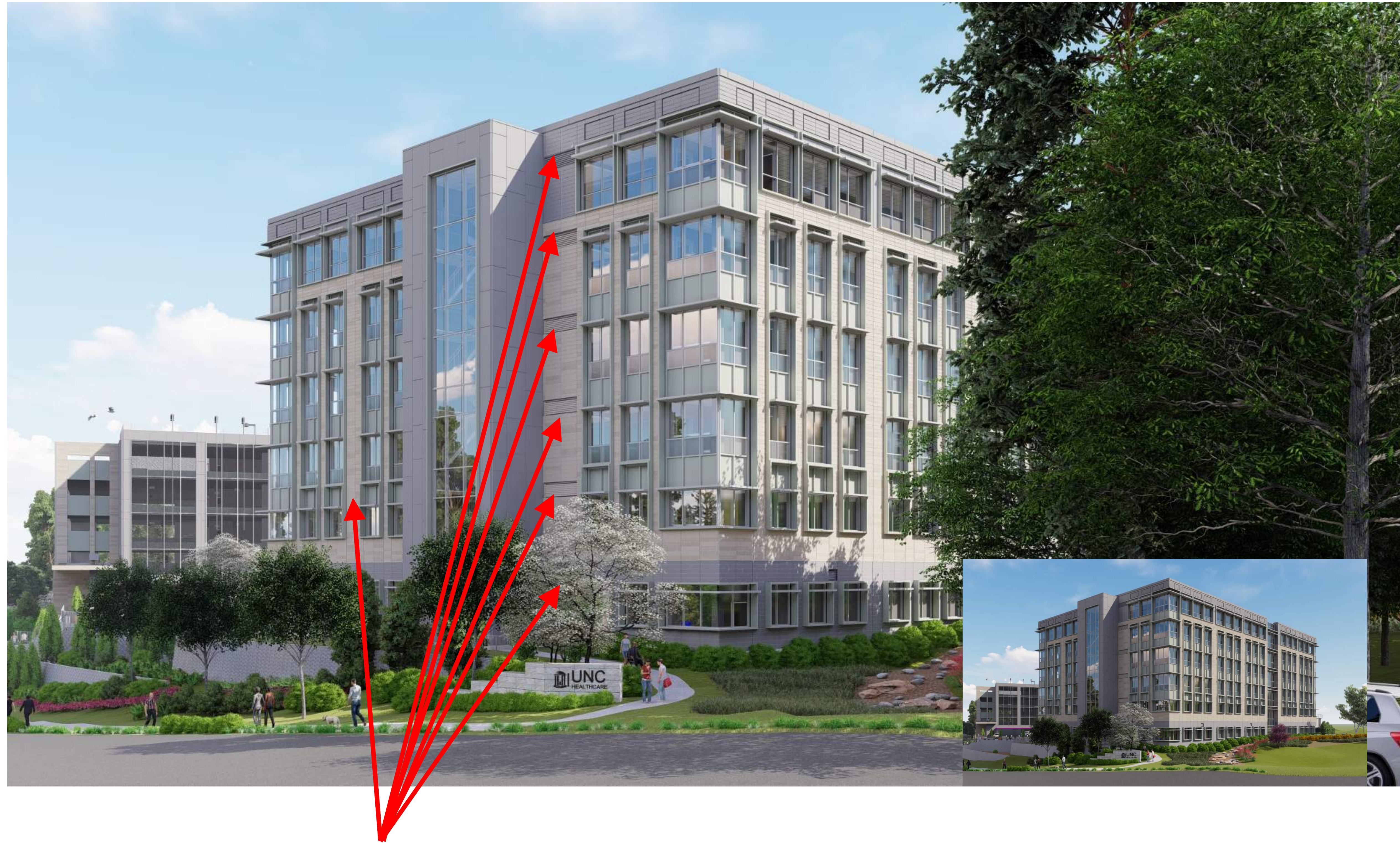
Proposed Outside Air Louver at the West Elevation