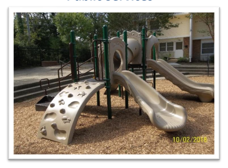
Public Facilities Improvements