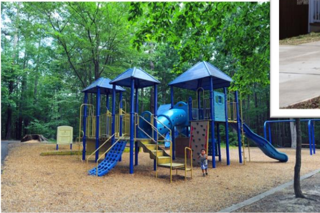
Public Facilities Improvements