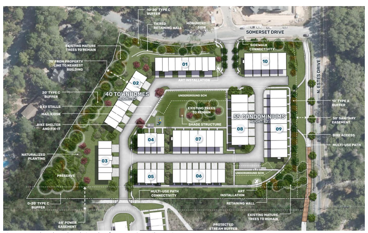
Figure 1: Updated rendered site plan for Town Council Meeting.