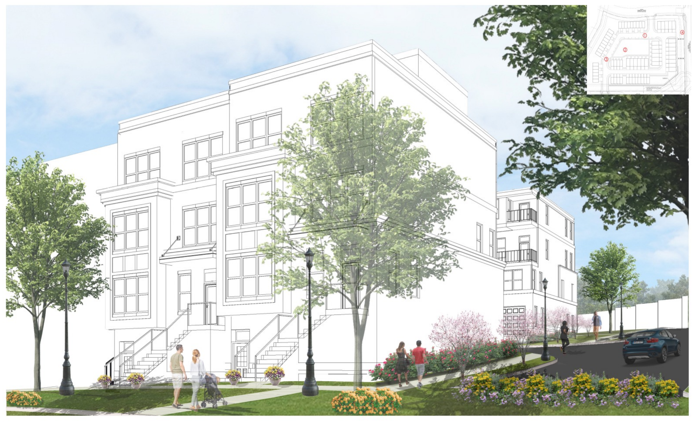
* Progress elevations subject to change.