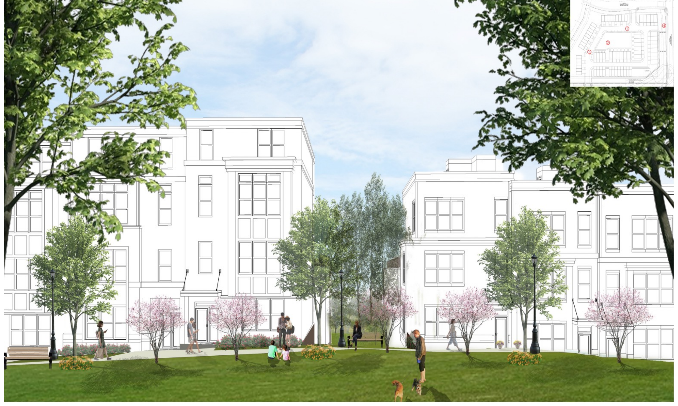
* Progress elevations subject to change.