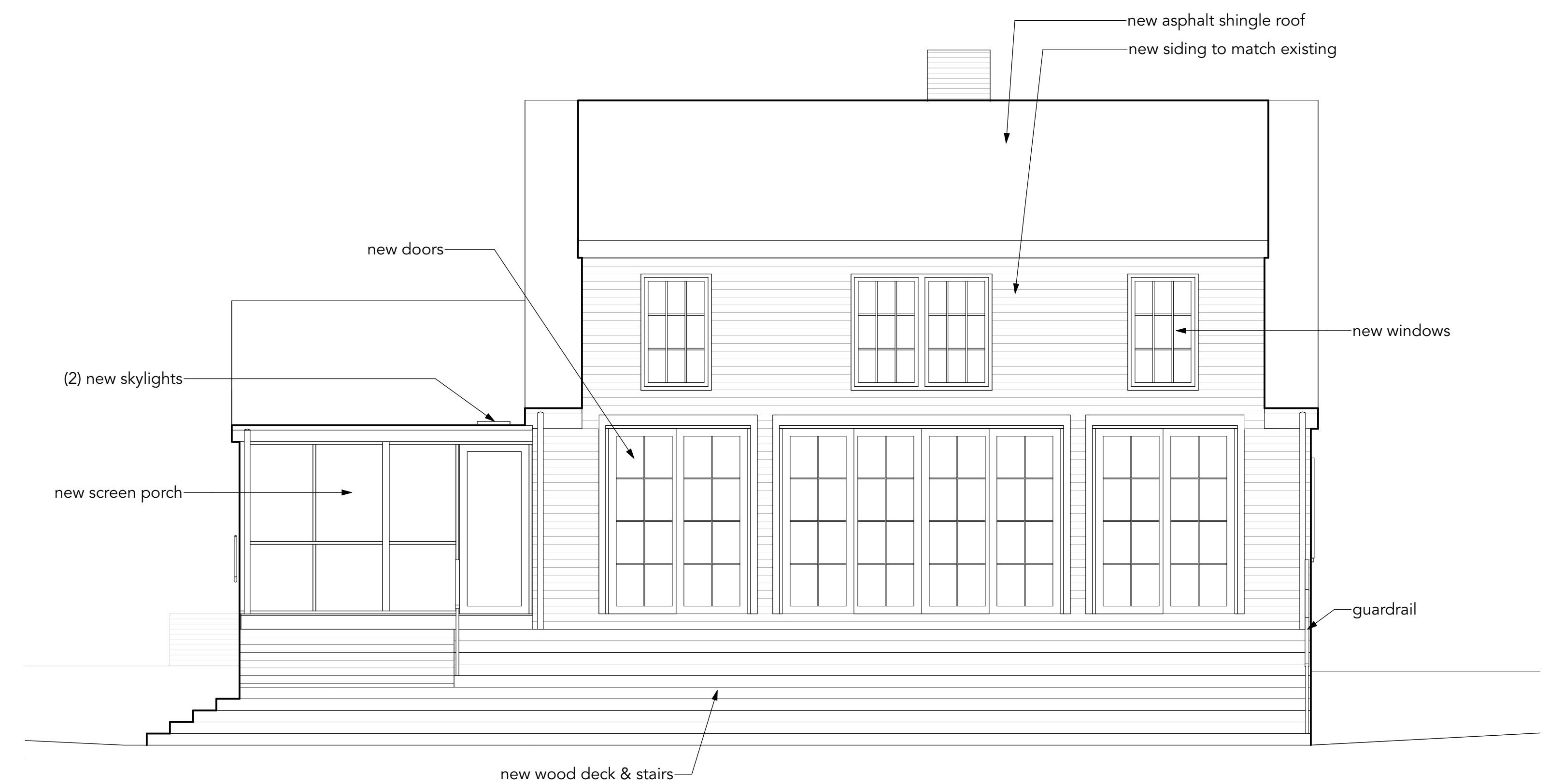
3 south elevation