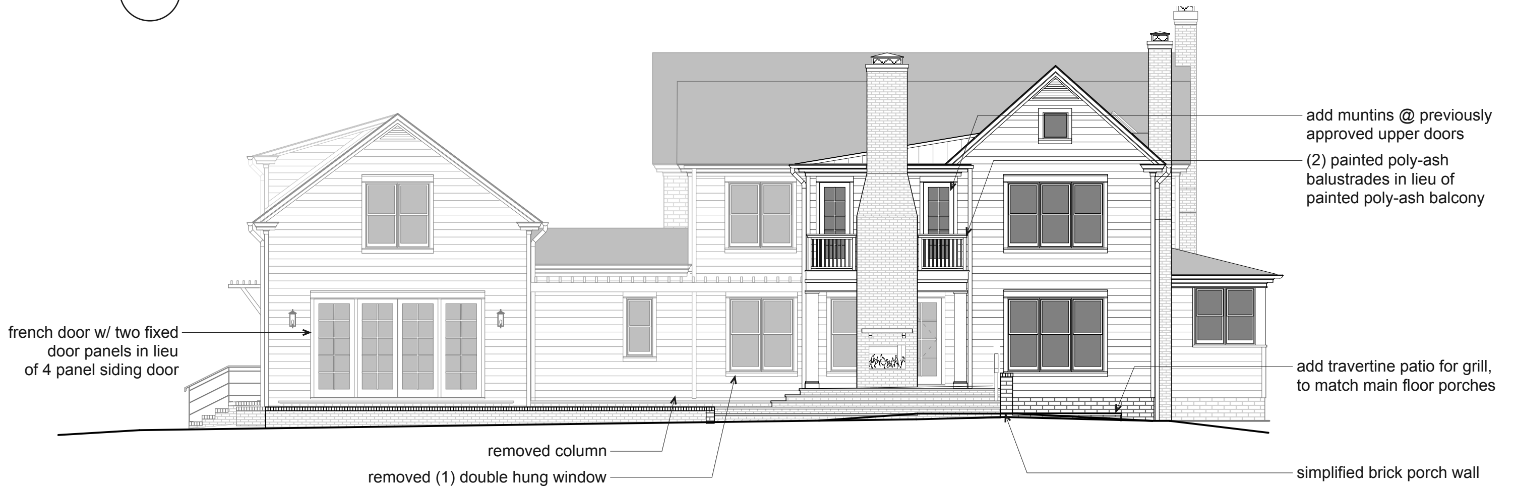
3 northeast elevation - proposed