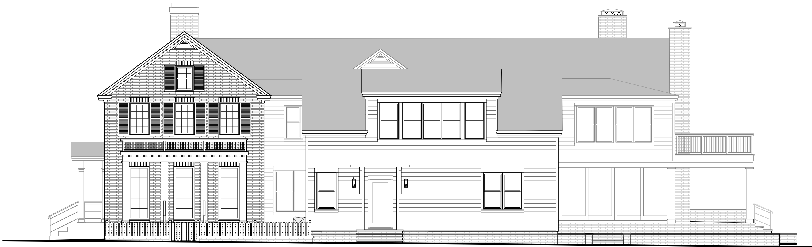
1 southeast elevation - APPROVED