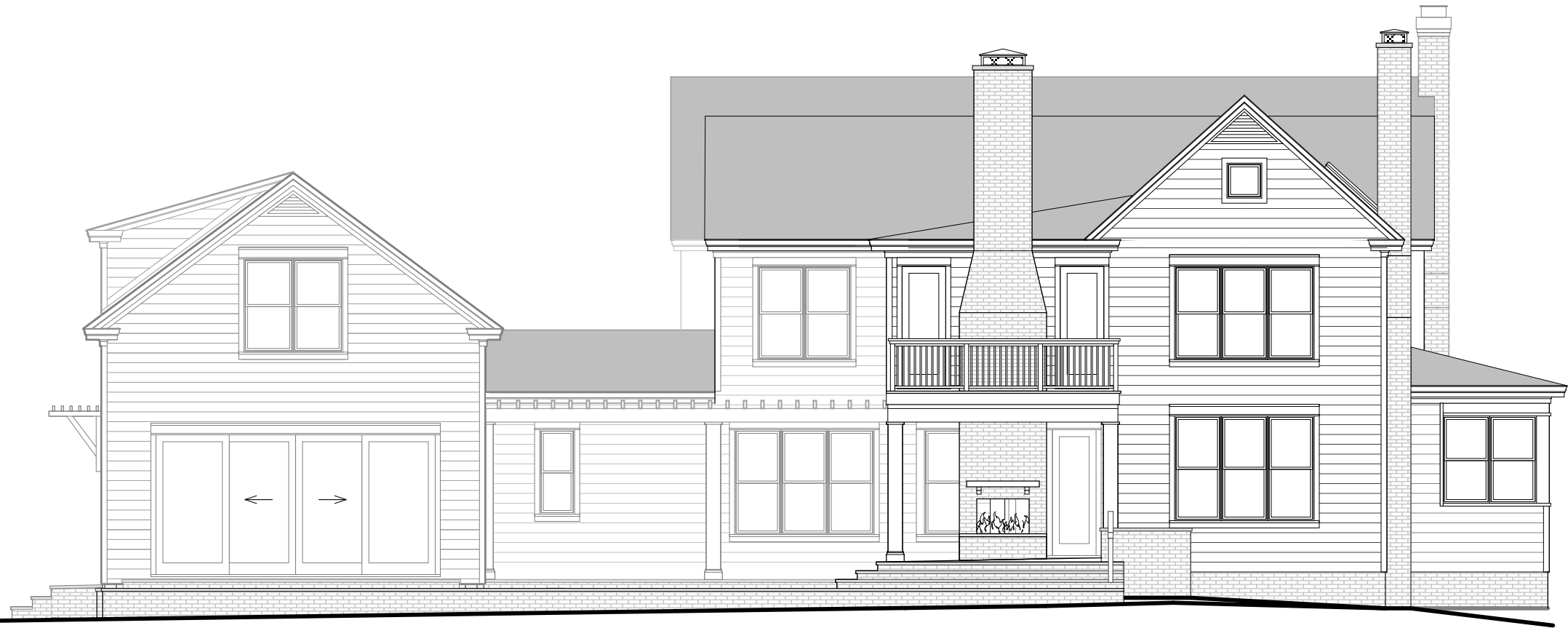
2 northeast elevation - APPROVED