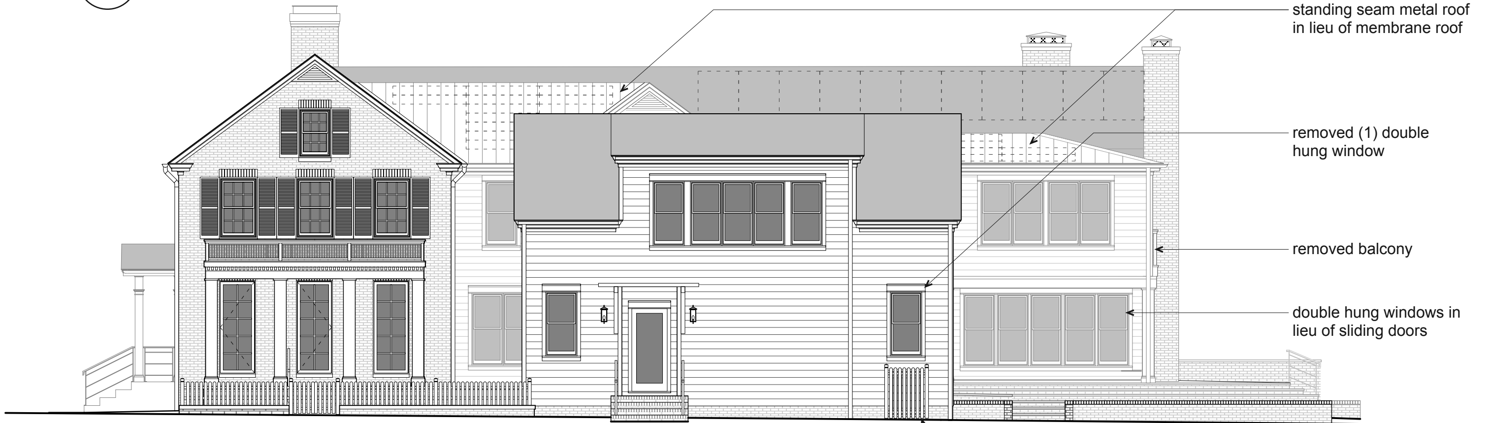
2 southeast elevation - proposed