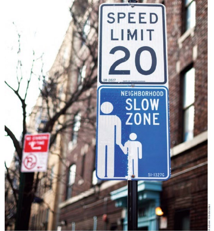
THE GATEWAY OF A NEIGHBORHOOD SLOW ZONE IN THE CLAREMONT SECTION OF THE BRONX.

Authorize Town Manager to establish Neighborhood Slow Zones as a traffic calming method.