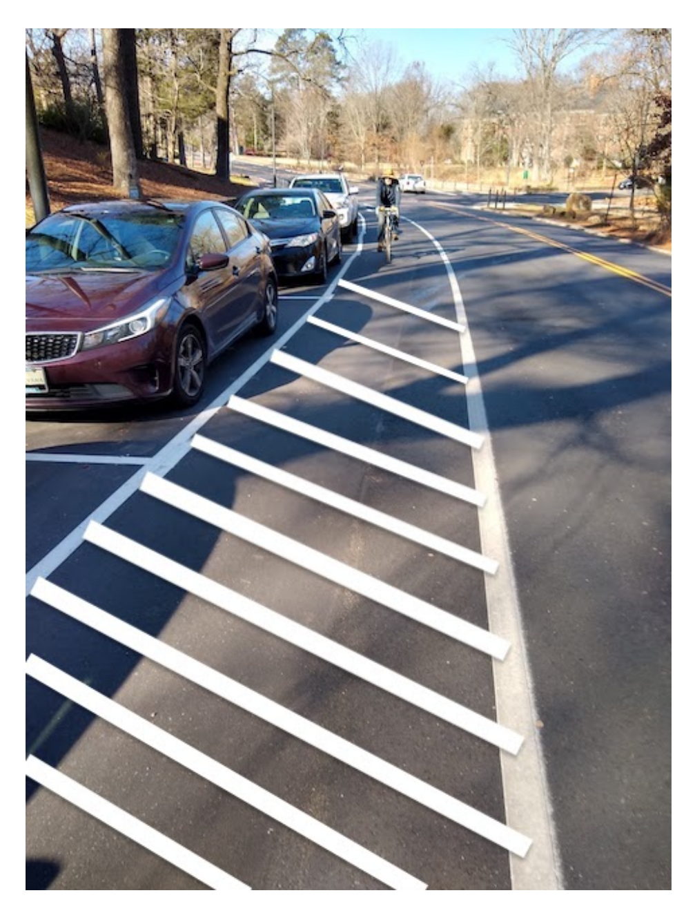
Image 3. Rather than a Bike Lane, it should be a buffer showing the area to avoid.

The Manual on Uniform Traffic Control Devices (MUTCD) says,