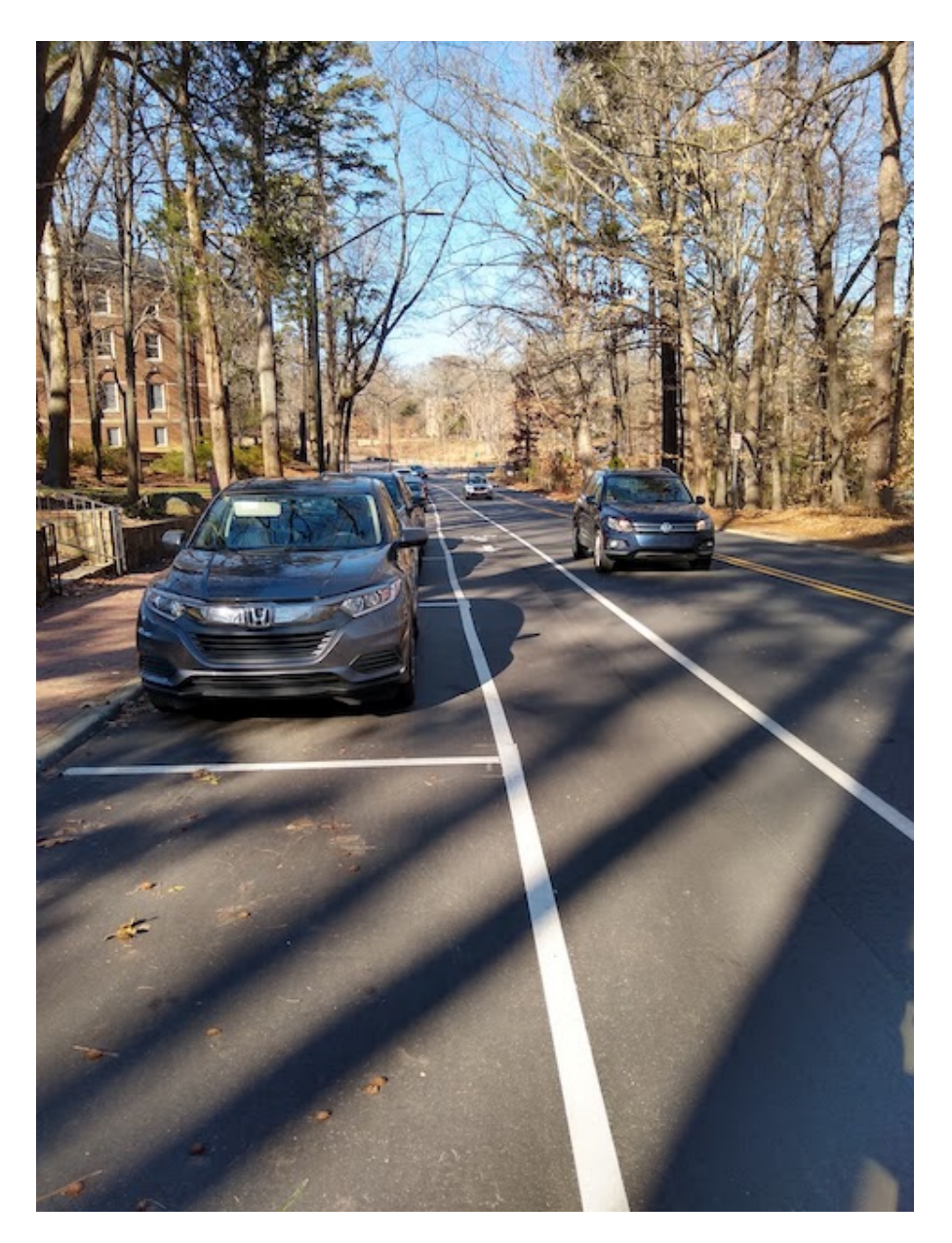
Image 1. The parking lane on Country Club Road is 8' wide, the Door Zone Bike Lane is 6', and the travel lane is just 10'.

Parked vehicles can abut the parking limit line. Opened doors can extend 3.5', leaving just 2.5' of Bike Lane clear space. Bicyclists are 2.5' wide but need 4' of clear operating space plus shy distances. Trucks, buses, and landscape trailers are 8.5' wide not including mirrors, and can abut the Bike Lane.