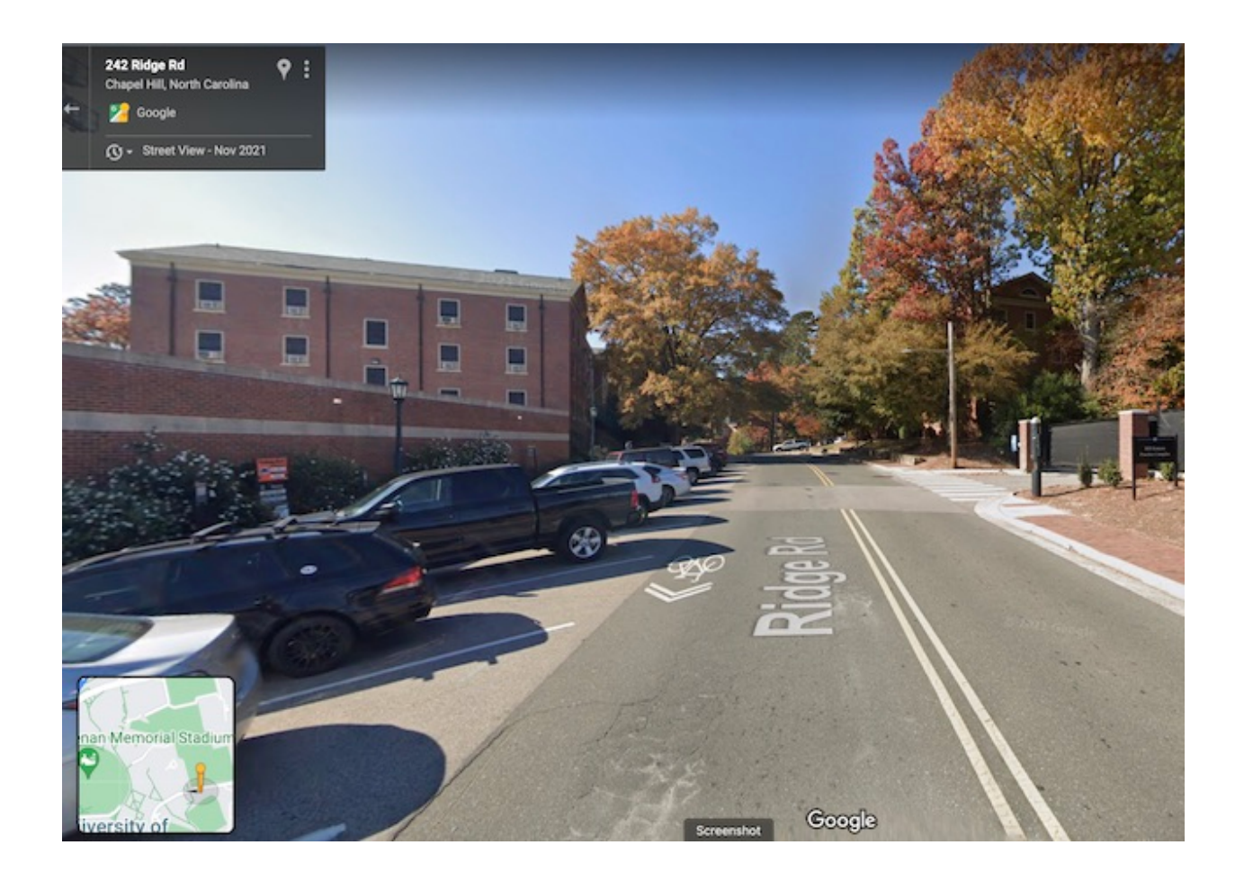
Image 5. Shared Lane Marking placed too close behind angled parking on Ridge Road.

Bicyclists riding over the markings are screened and vulnerable to backing vehicles.