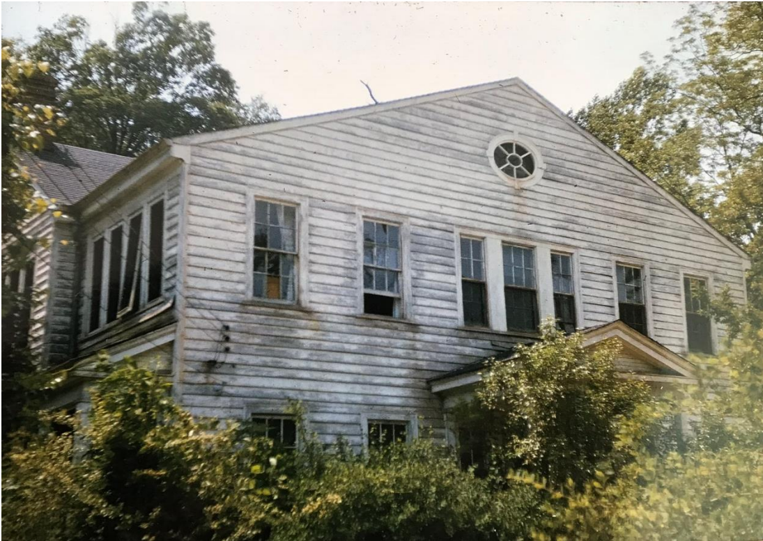
Photo showing the rear elevation, likely taken in the early 1960's, near the time of purchase (2/27/1964) by the Baptist State Convention of North Carolina.

The one- and two-story rear wings were added after 1949. [Sanborn 1925, 1932, 1949]. 4