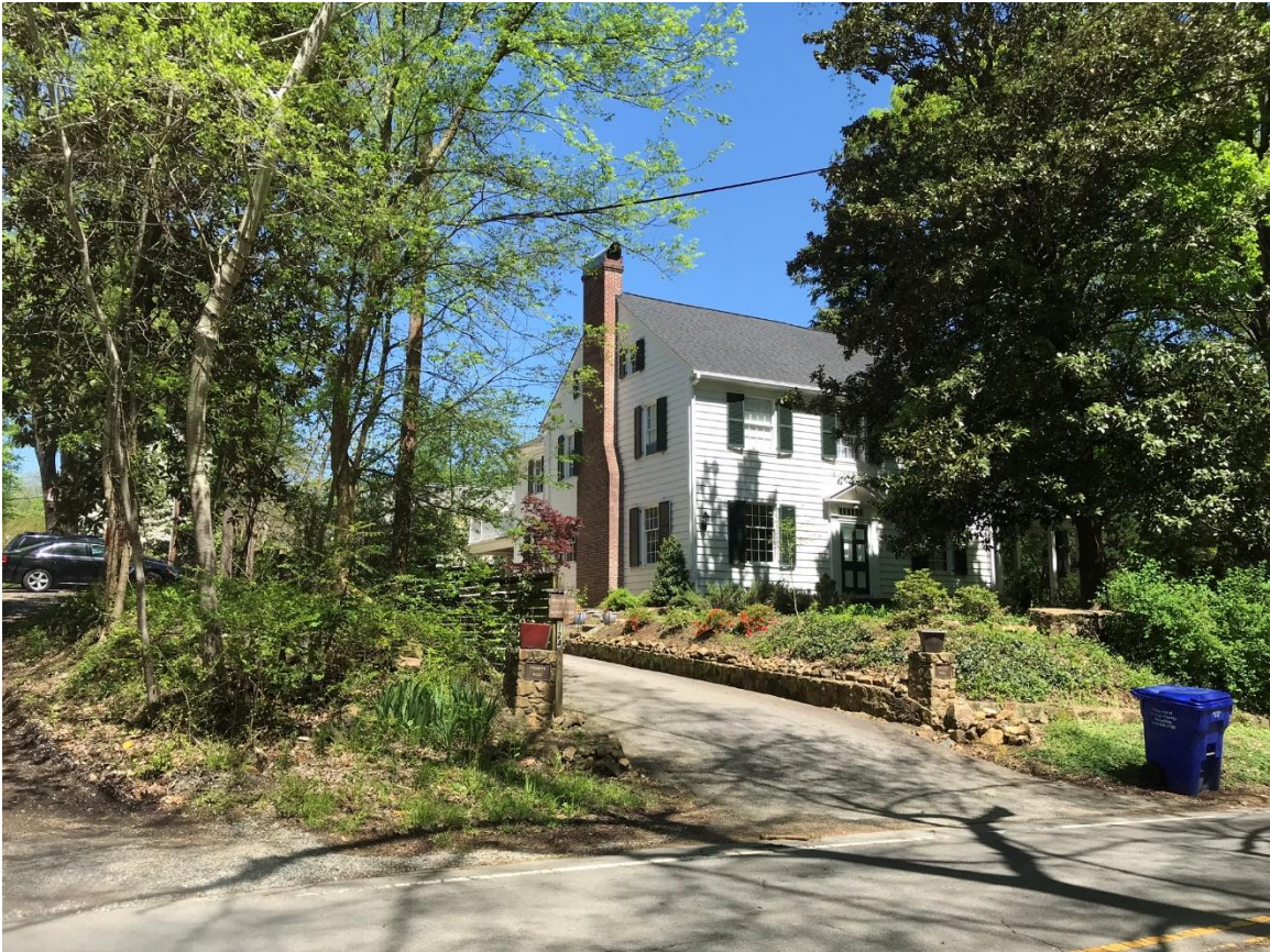
124 S. Boundary Street from S. Boundary Street