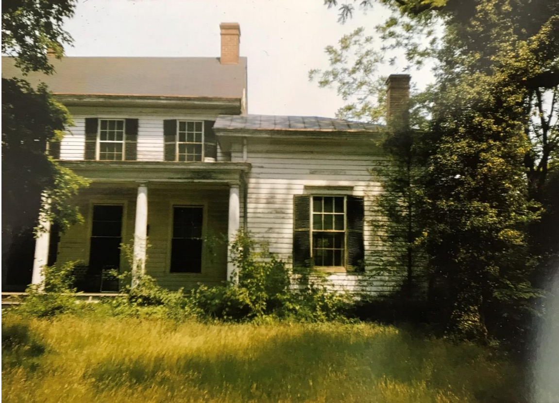
Photo showing the southern end of the front elevation, likely taken in the early 1960's, near the time of purchase (2/27/1964) by the Baptist State Convention of North Carolina.