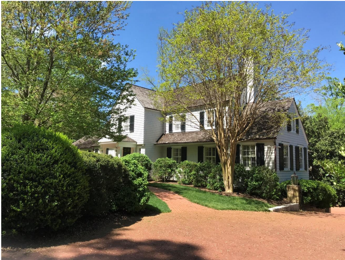
511 Senlac Road from Senlac Road