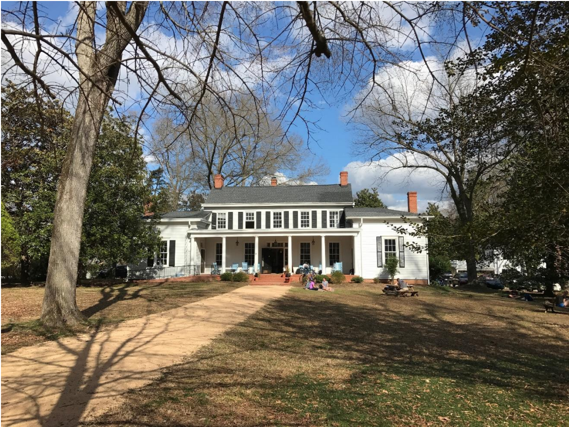
The house today, showing the front elevation.