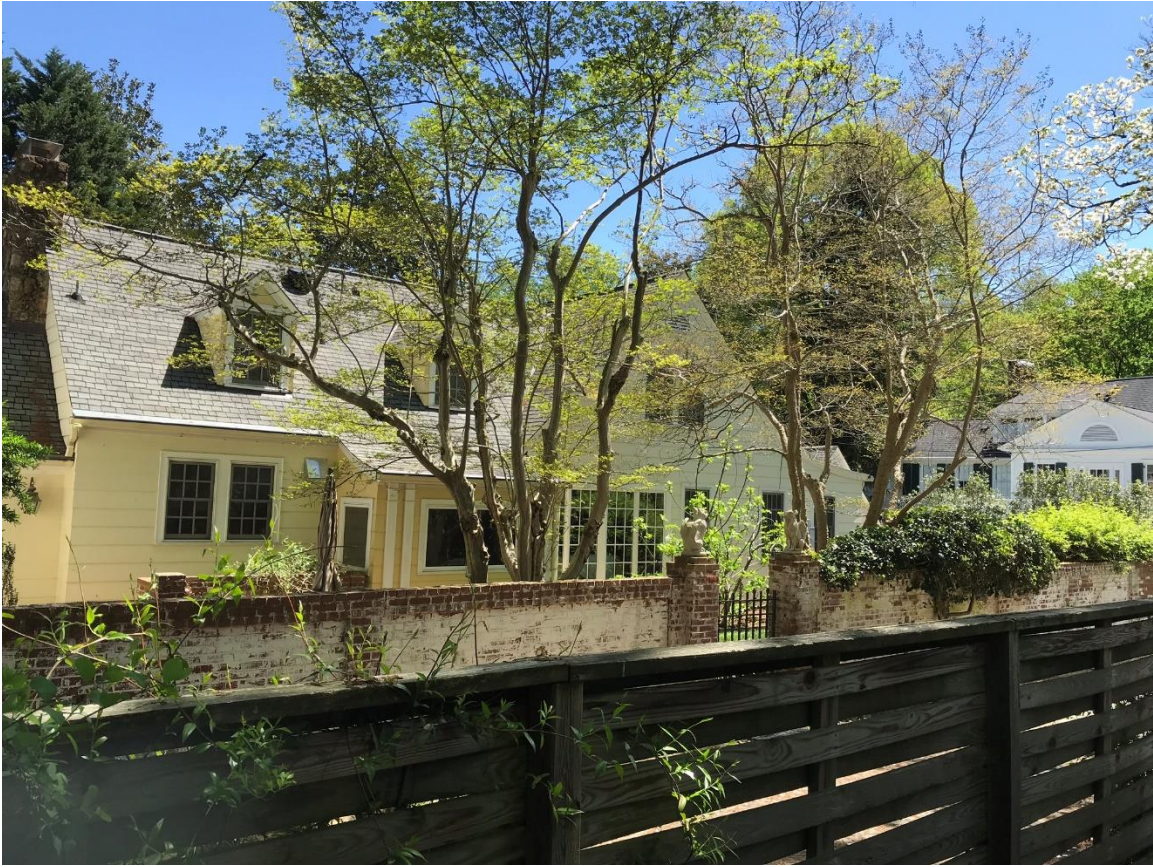
514 Senlac Road from 203 Battle Lane