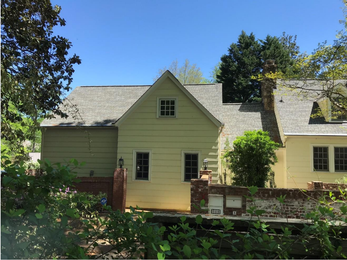
514 Senlac Road from 203 Battle Lane