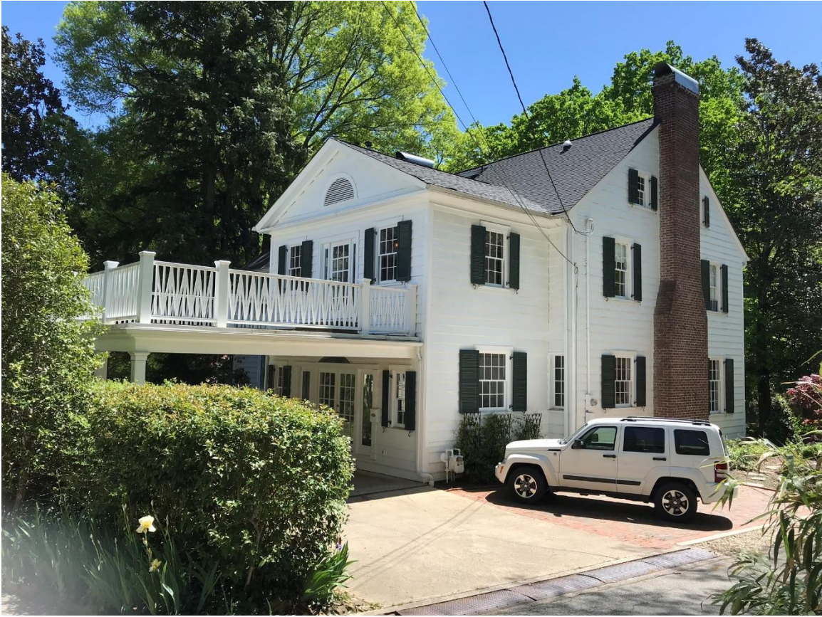
124 S. Boundary Street from 203 Battle Lane