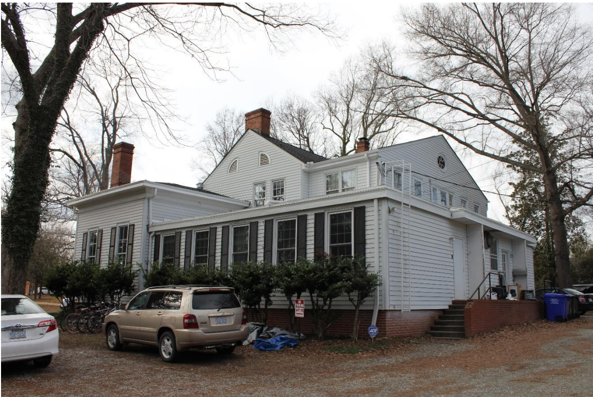
The house today, showing the south and rear elevations and showing the post-1949 addition.