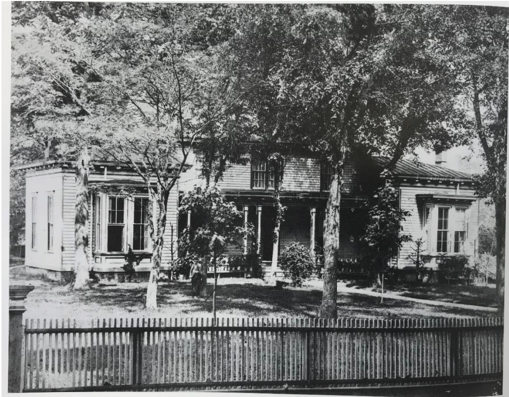
Senlac, circa 1884