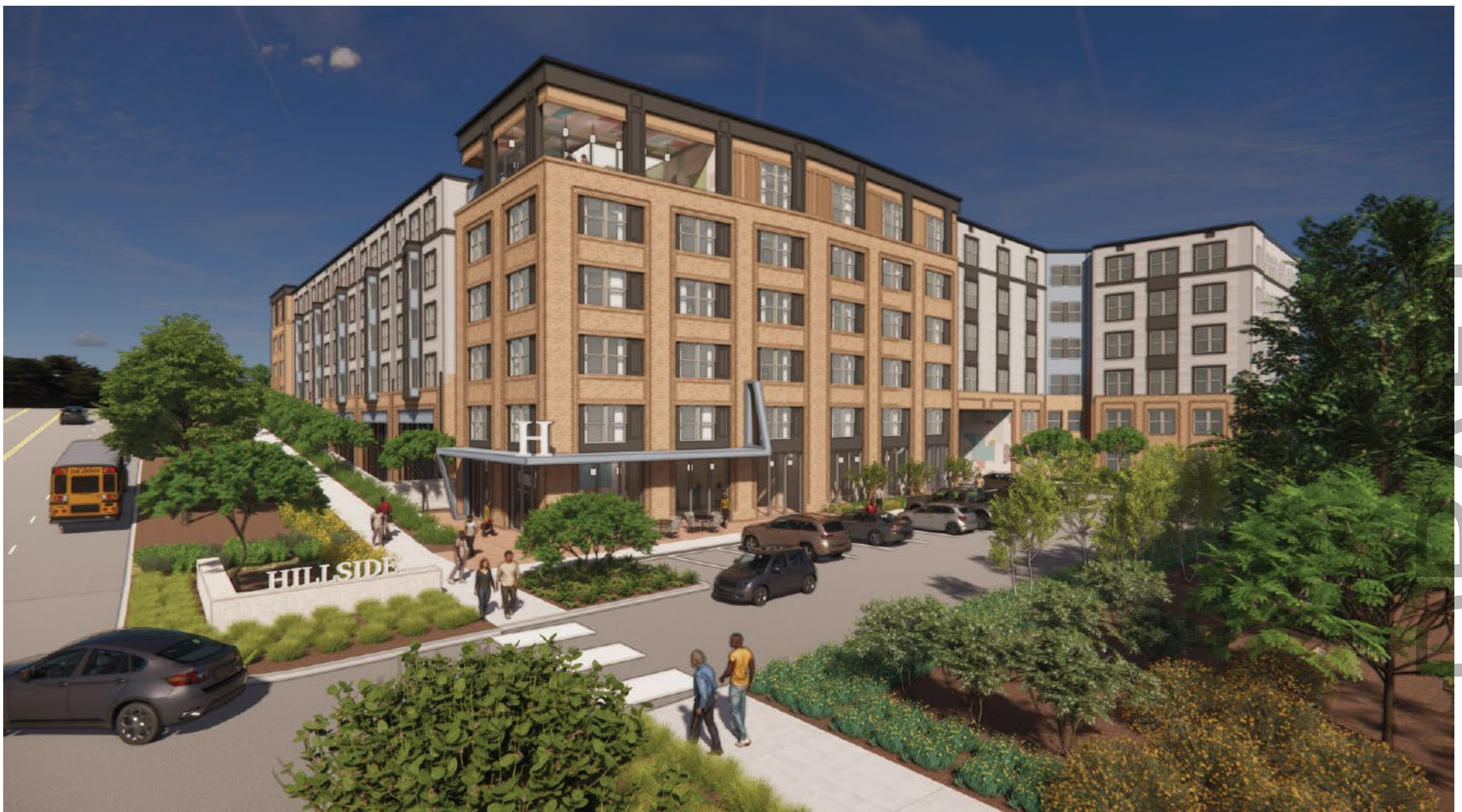
Architectural Rendering Looking towards downtown