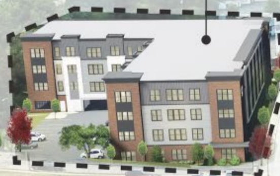
THE JUNCTION AT 511 511 W SOUTH STREET