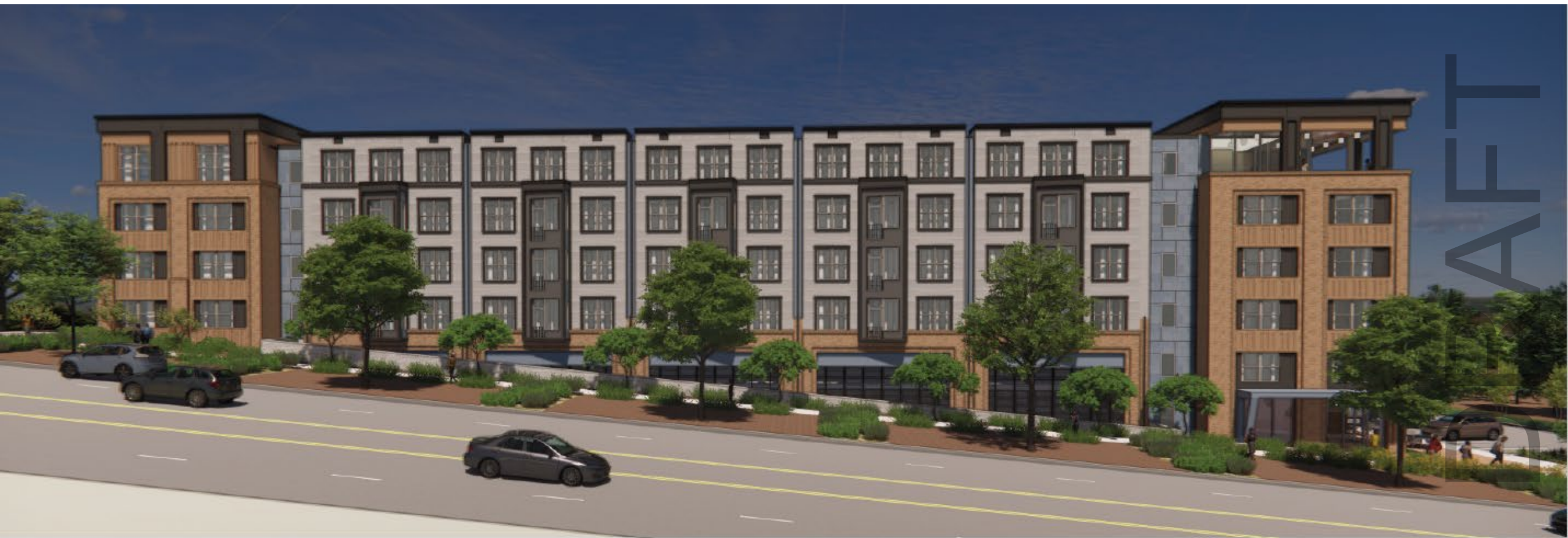
Architectural Rendering Facing Hillside Trace