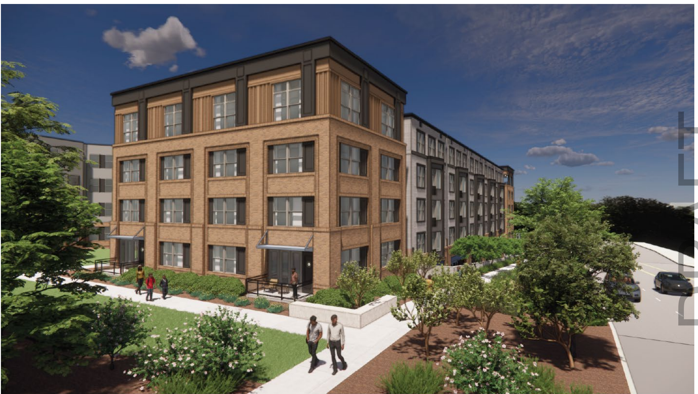
Architectural Rendering Looking away from downtown