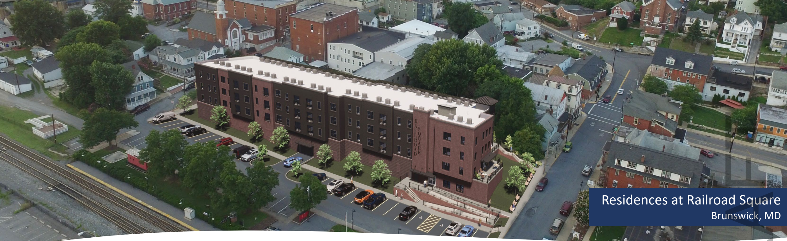
Residences at Railroad Square Brunswick, MD