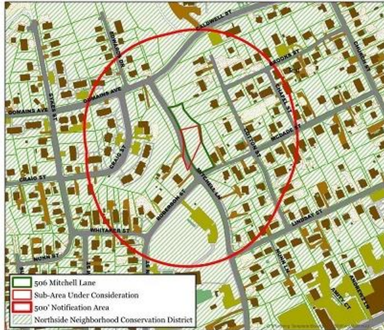
500' Notification Map 506 Mitchell Lane, Chapel Hill