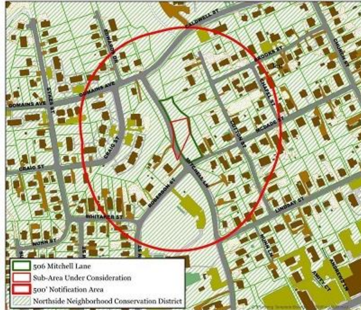
500' Notification Map 506 Mitchell Lane, Chapel Hill