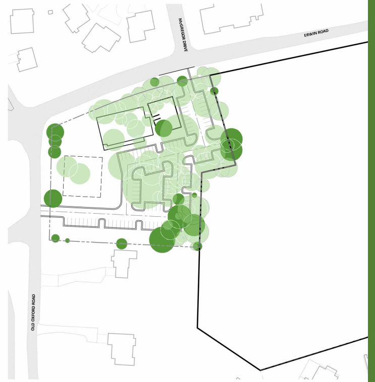
Merger of Site Plan and Tree Information from Applicant Submitted Material Drawing Prepared by The Nau Company & Radway Design