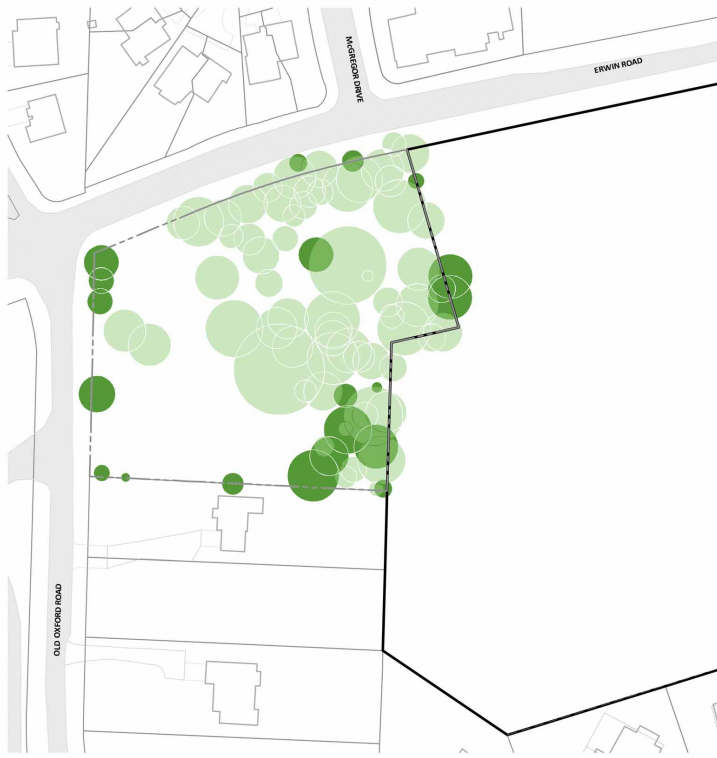
Tree Survey Information Taken from Applicant Submitted Material Drawing Prepared by The Nau Company & Radway Design