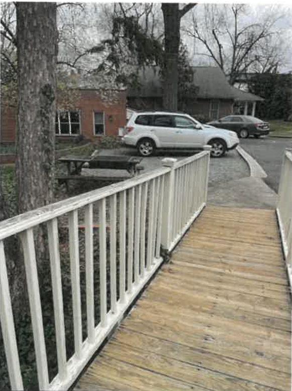
Existing wood railing West of proposed area