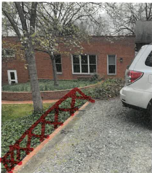
Location for Proposed New Wood Railing marked with Red X's