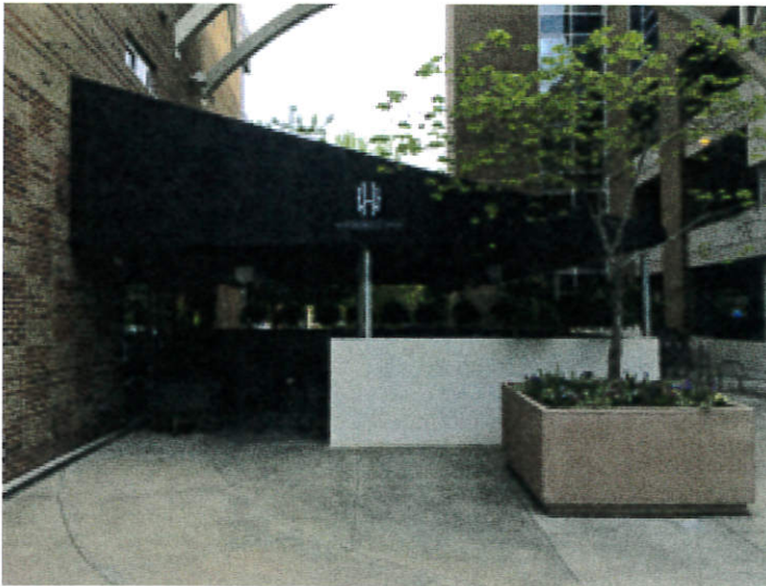
1. VIEW OF CANOPY AND PATIO FROM NORTH

This recently opened restaurant includes an existing canopy and patio at the east side of the building. The canopy was built and permitted during a previous upfit to the building.