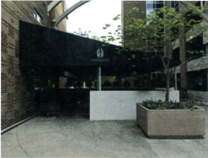
1. VIEW OF CANOPY AND PATIO FROM NORTH

This recently opened restaurant includes an existing canopy and patio at the east side of the building. The canopy was built and permitted during a previous upfit to the building.