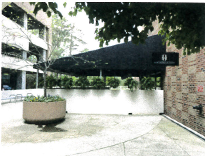
3. VIEW OF CANOPY AND PATIO FROM NORTH

The wall is parged with white mortar with added sand to provide an attractive, clean finish.