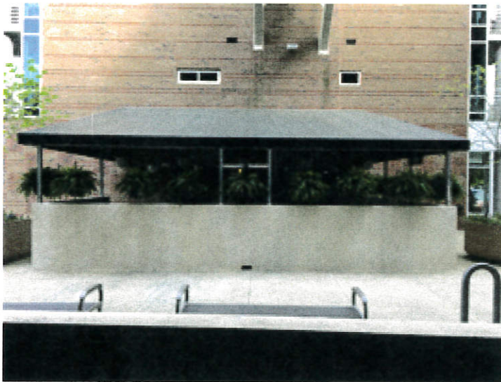
2. VIEW OF CANOPY AND PATIO FROM WEST

We request approval to these changes to the existing building after the fact.