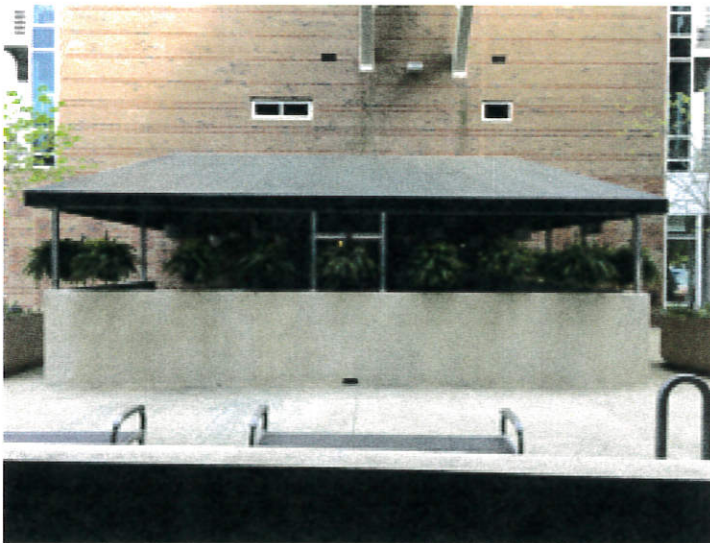
2. VIEW OF CANOPY AND PATIO FROM WEST

We request approval to these changes to the existing building after the fact.