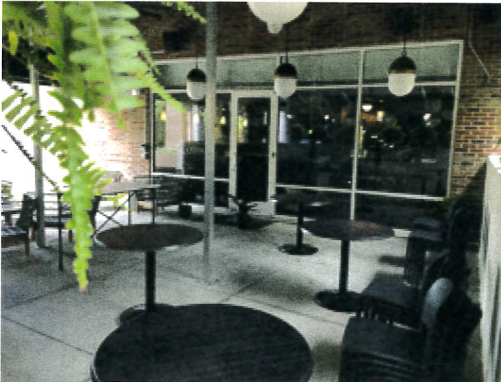
5. VIEW OF DINING AREA AND INTERIOR DINING ROOM BEYOND