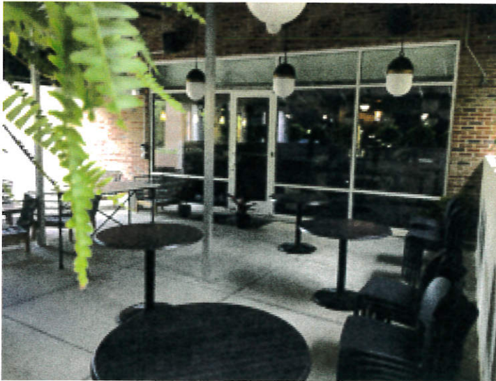
5. VIEW OF DINING AREA AND INTERIOR DINING ROOM BEYOND