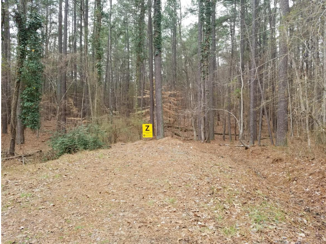
View of site from Hartig Street