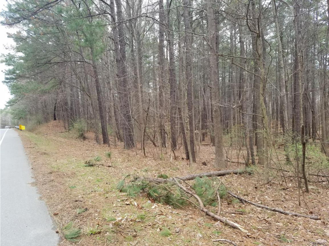
View from Park & Ride