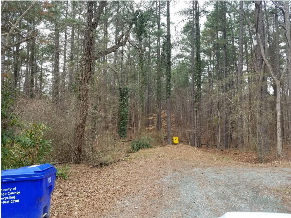
View from northeast