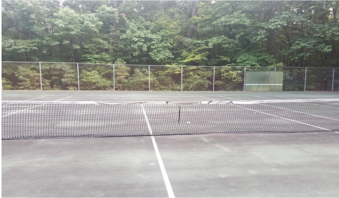
Ephesus Park - Courts