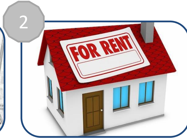
Rental Subsidy & Development