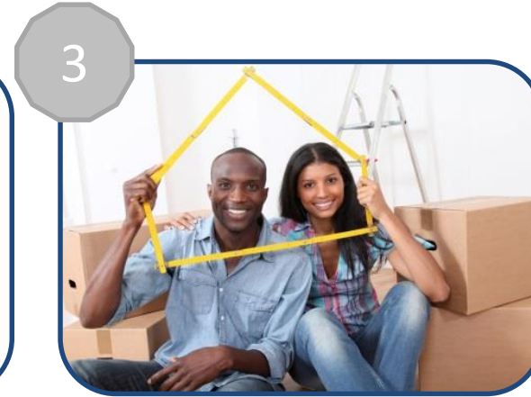
Homeownership Development & Assistance