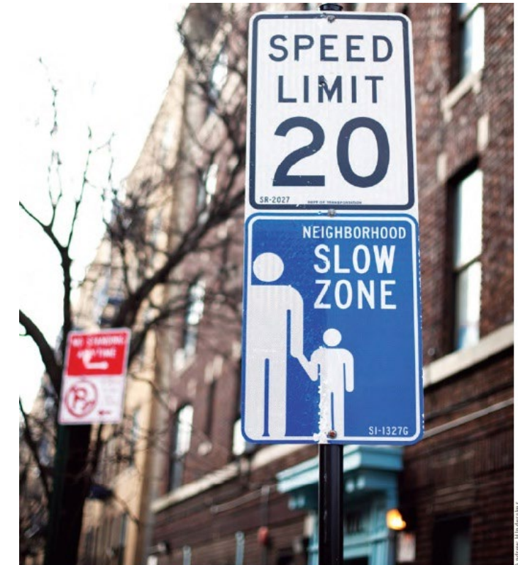
THE GATEWAY OF A NEIGHBORHOOD SLOW ZONE IN THE CLAREMONT SECTION OF THE BRONX.

Authorize Town Manager to establish Neighborhood Slow Zones as a traffic calming method.