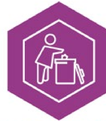
Waste, Water & Natural Resources