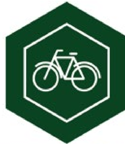
Transportation & Land Use