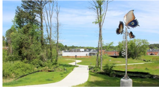
images: Around Town at Eubanks Park & Ride (left); butterfly "Welcome" sculpture at Booker Creek Basin Park (right)