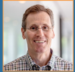
Robert Dowling Community Home Trust