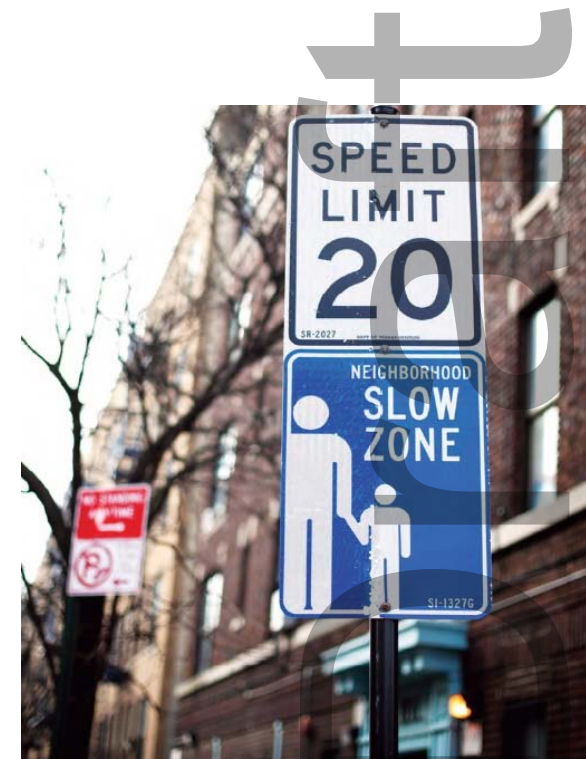
THE GATEWAY OF A NEIGHBORHOOD SLOW ZONE IN THE CLAREMONT SECTION OF THE BRONX.

Authorize Town Manager to establish Neighborhood Slow Zones as a traffic calming method.