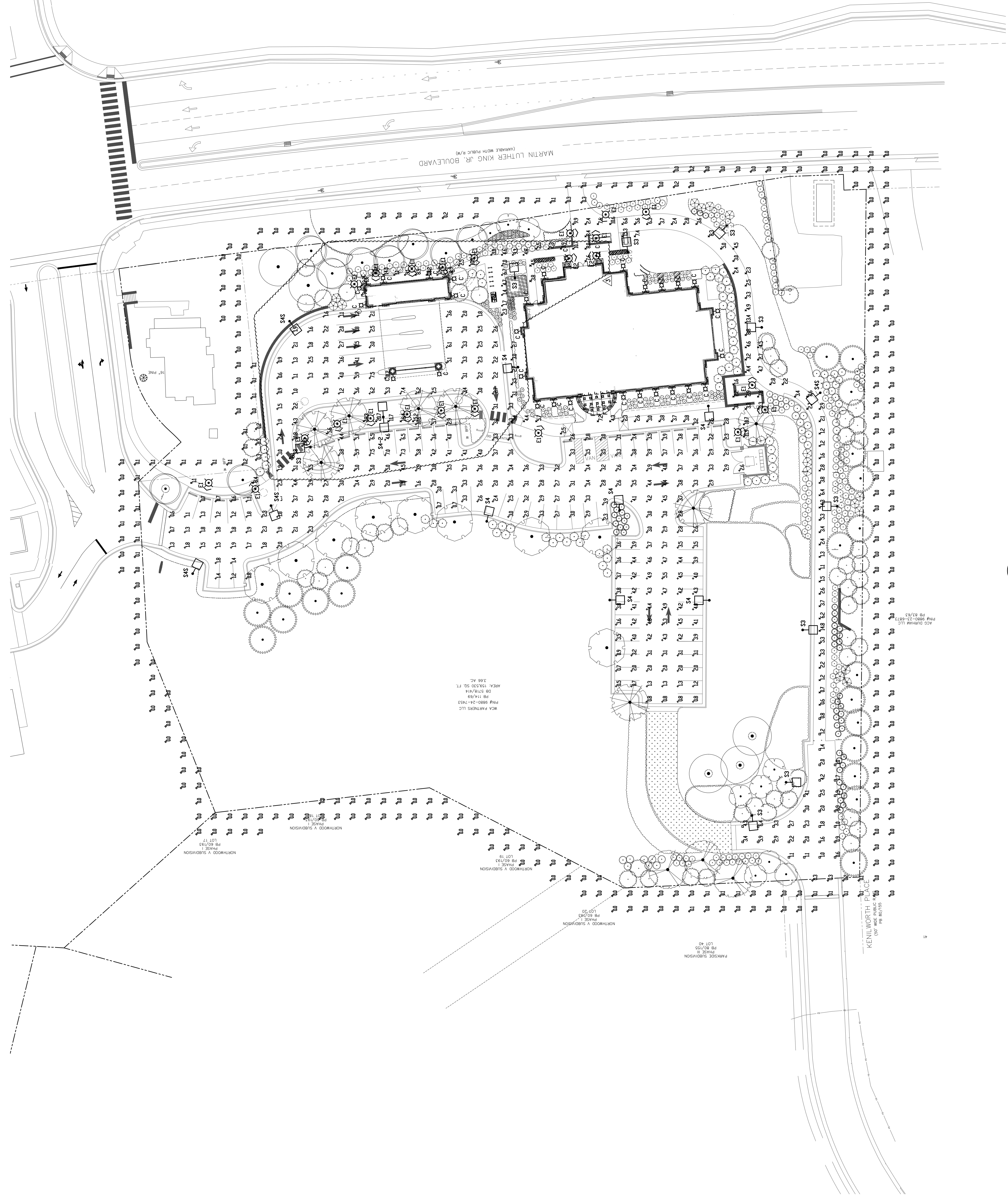
1 SITE PLAN - PHOTOMETRICS SCALE 1" = 80'