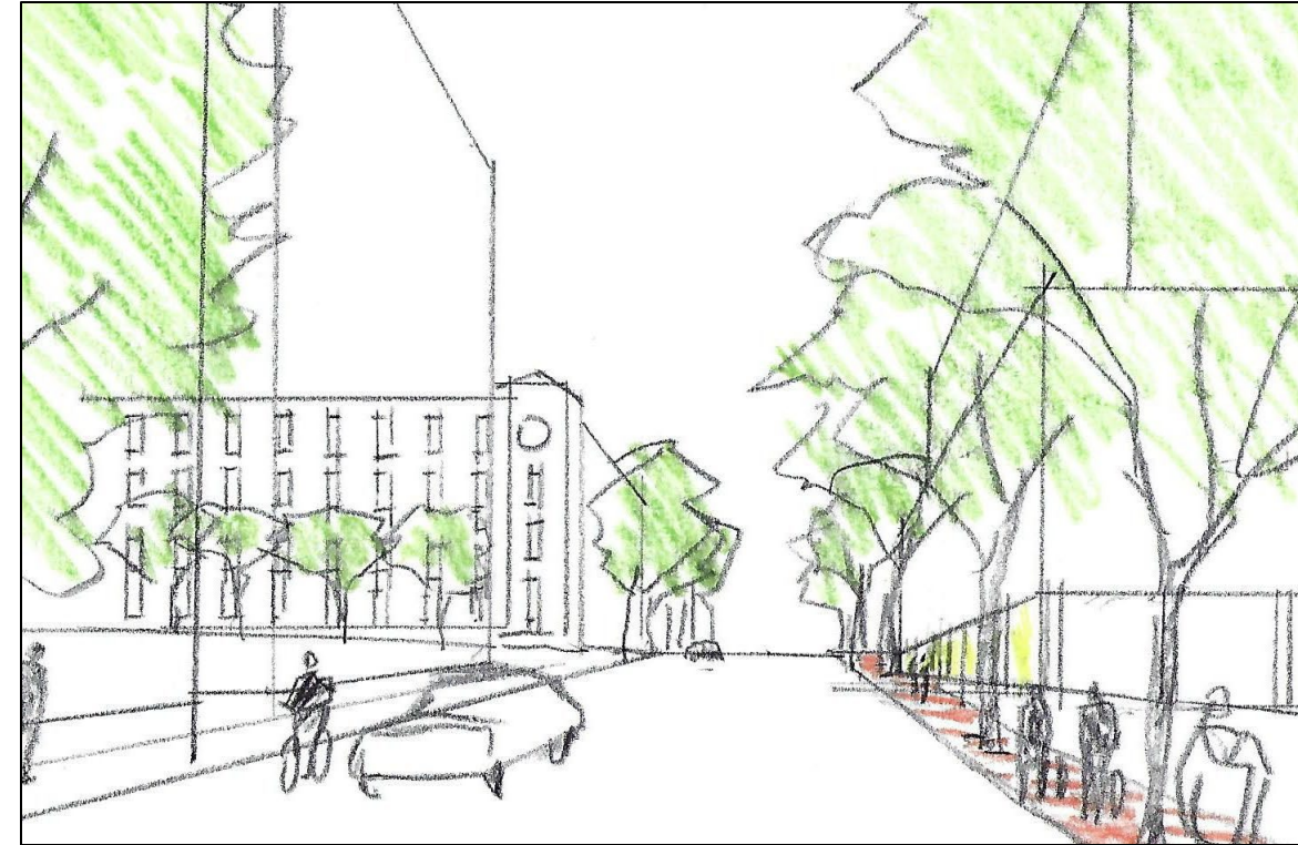
Rosemary Street View – Early Concept