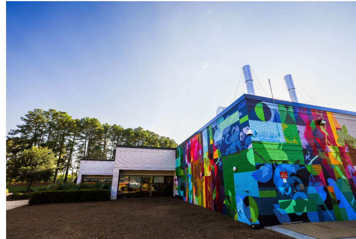
Exchange at Imperial Center – RTP, NC