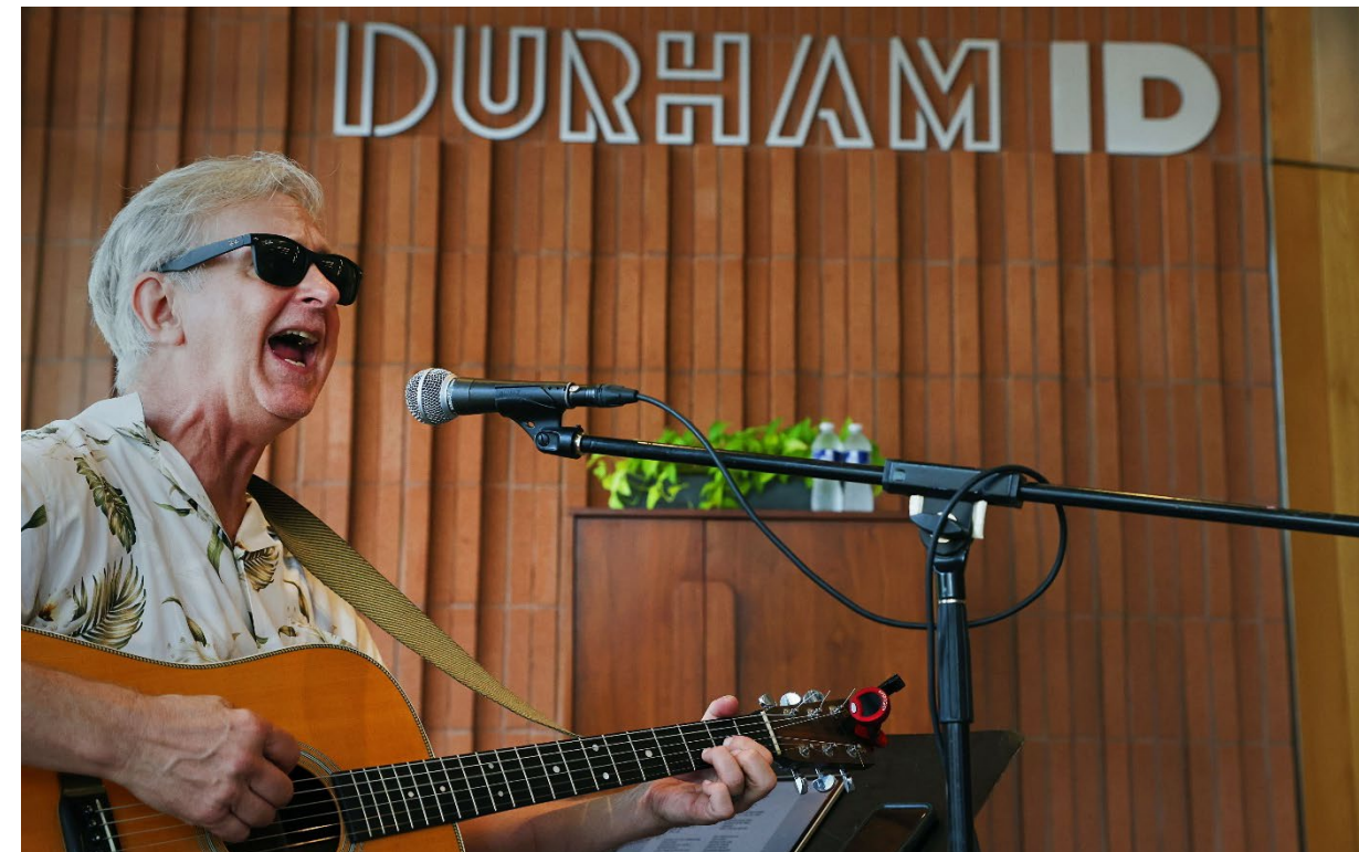
Live Music & Events (Durham ID)