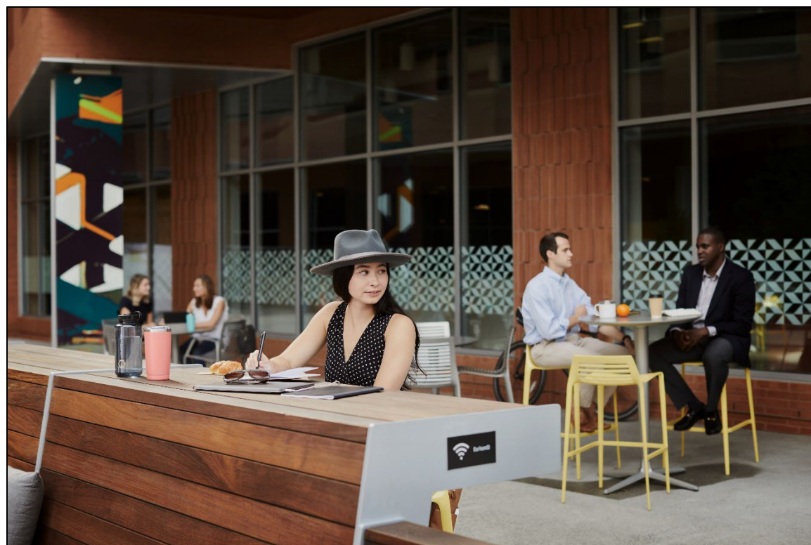
Durham ID Public Space