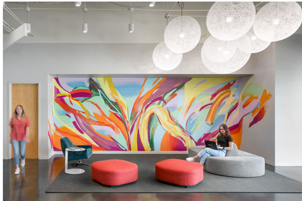
Triangle LIFE – RTP, NC