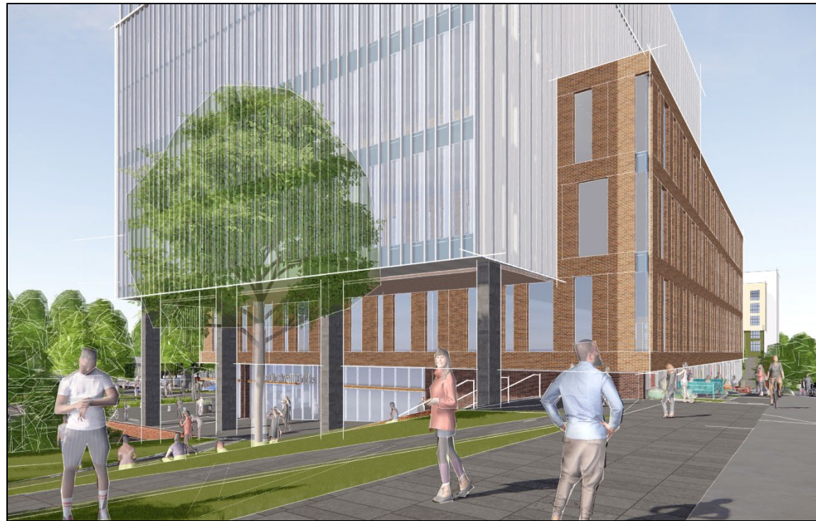
Rosemary Street Plaza Entrance