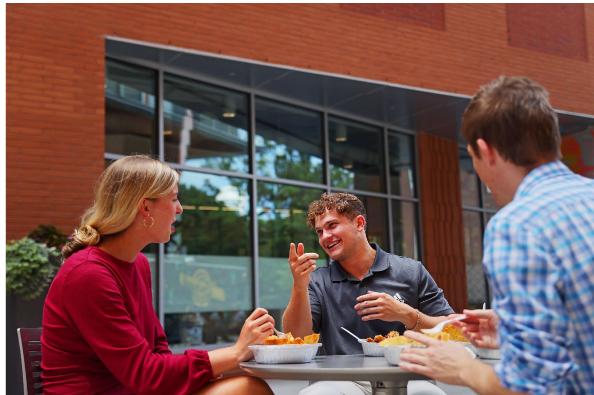
Courtyard & Eating Space (Durham ID)