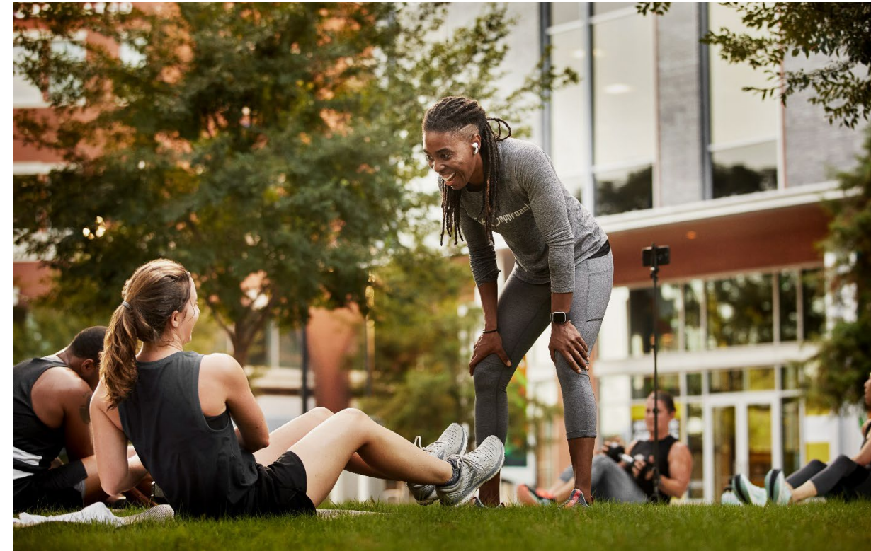
Fitness Classes (Durham ID)