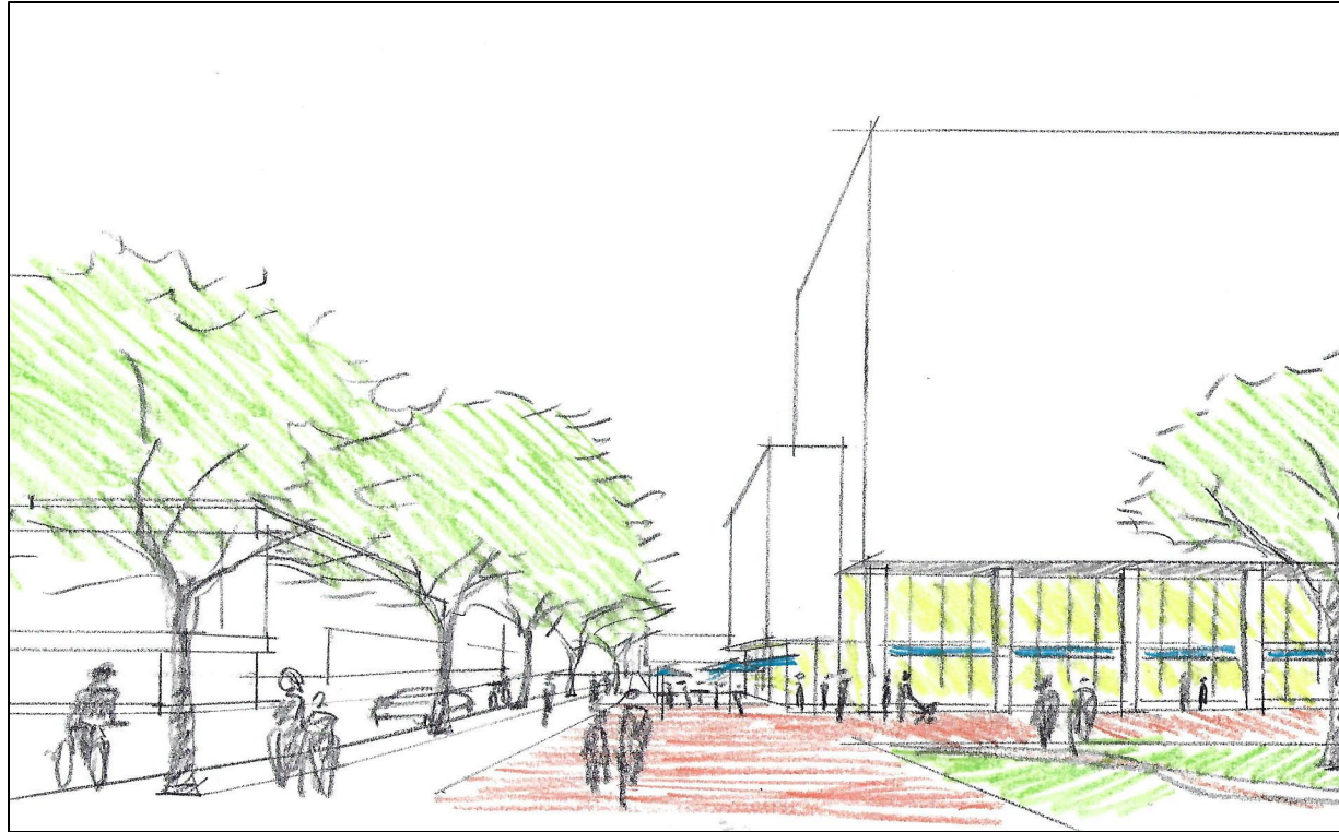
Franklin Street View – Early Concept