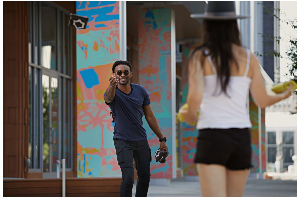
Games & Happy Hours (Durham ID)