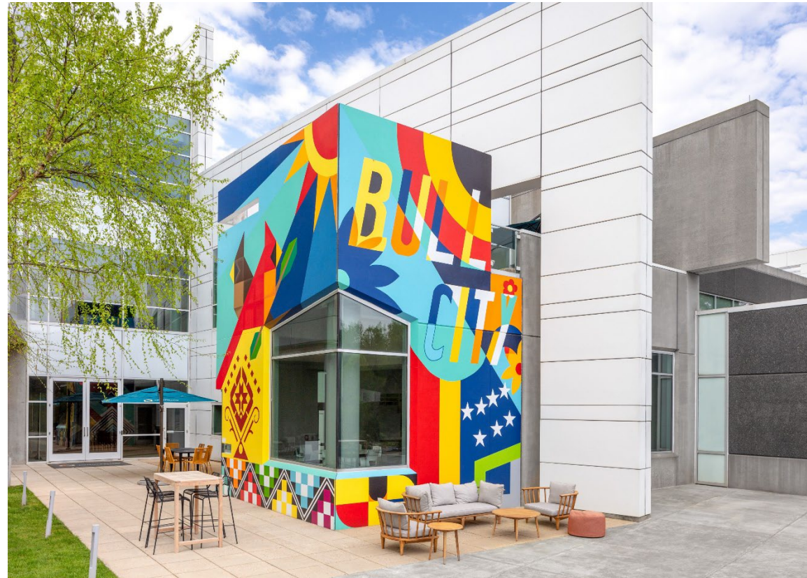
BioPoint – Durham, NC