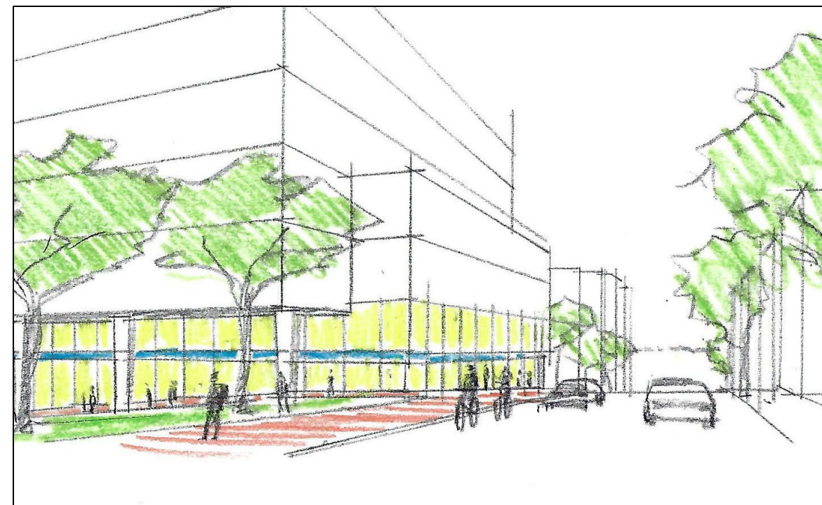
Rosemary Street View – Early Concept