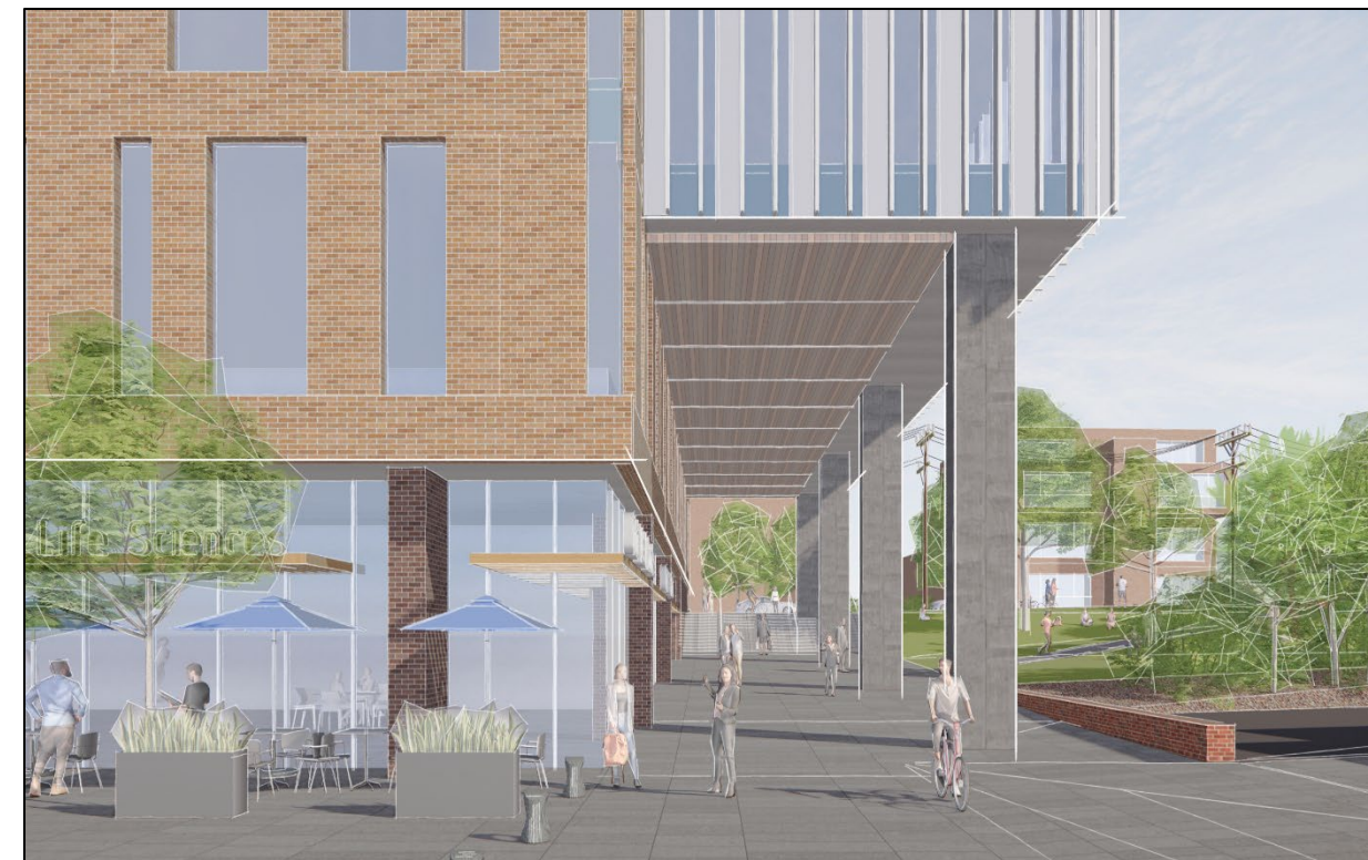
Franklin Street Retail and Plaza