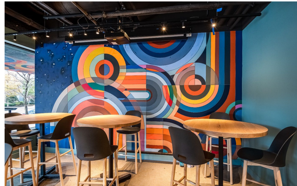
Restaurant at CambridgePark Drive (Boston, MA)