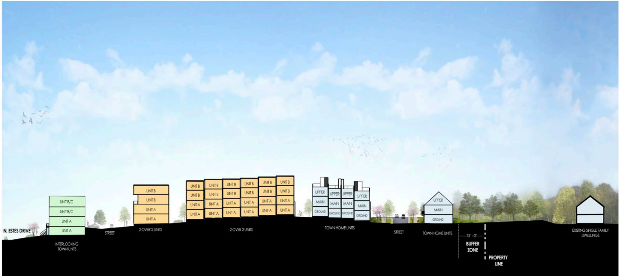
NORTH-SOUTH SITE SECTION (SECTION B)