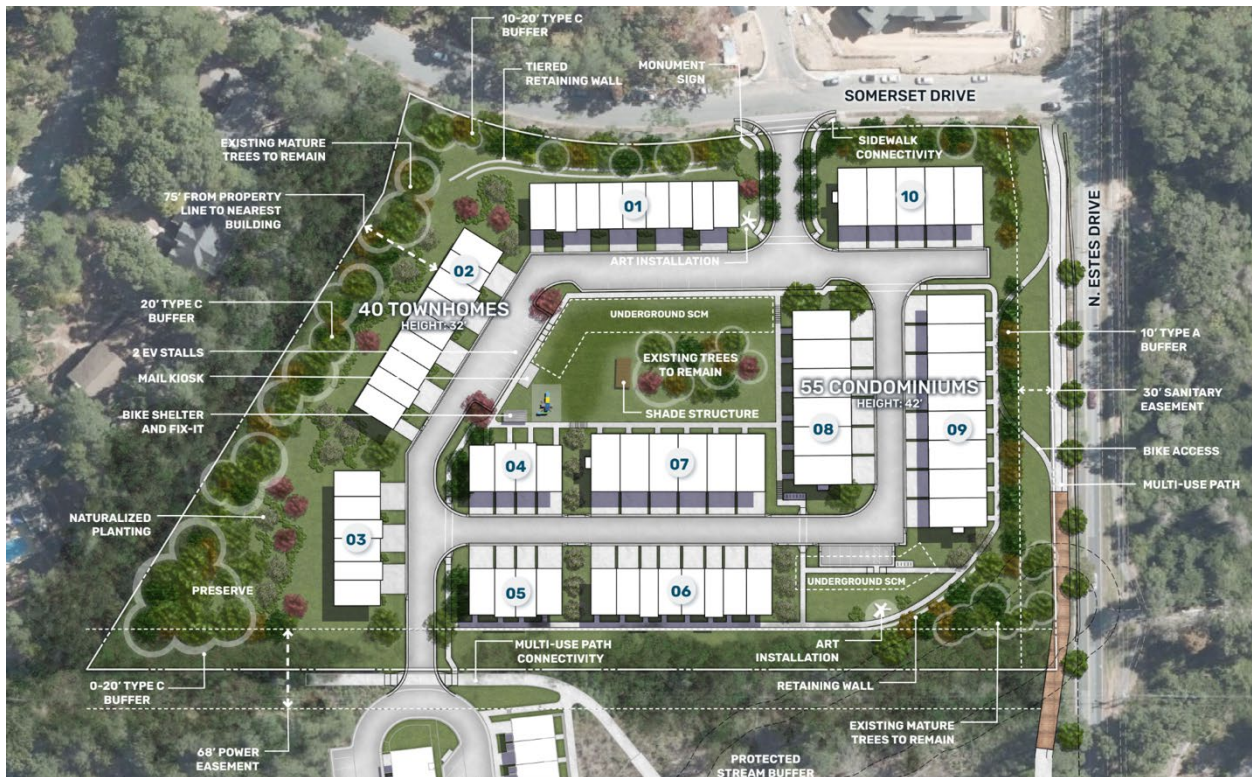
Figure 1: Updated rendered site plan for Town Council Meeting.