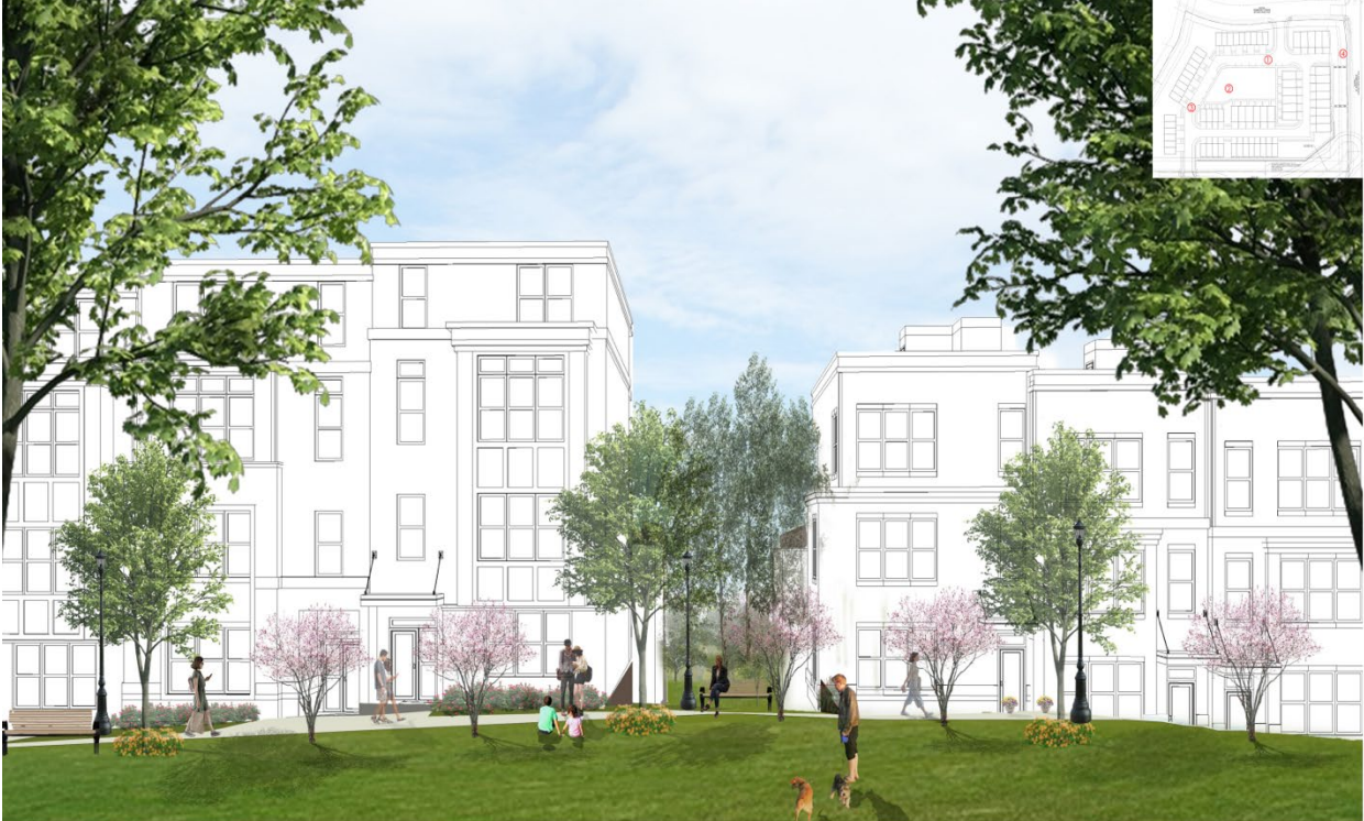
STREET PERSPECTIVE #2