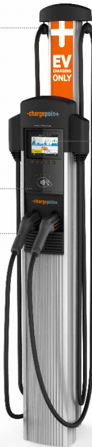
ChargePoint CT4000 Dual-port pedestal charging station with 18' charging cables

Strong and rugged design materials built to withstand the elements