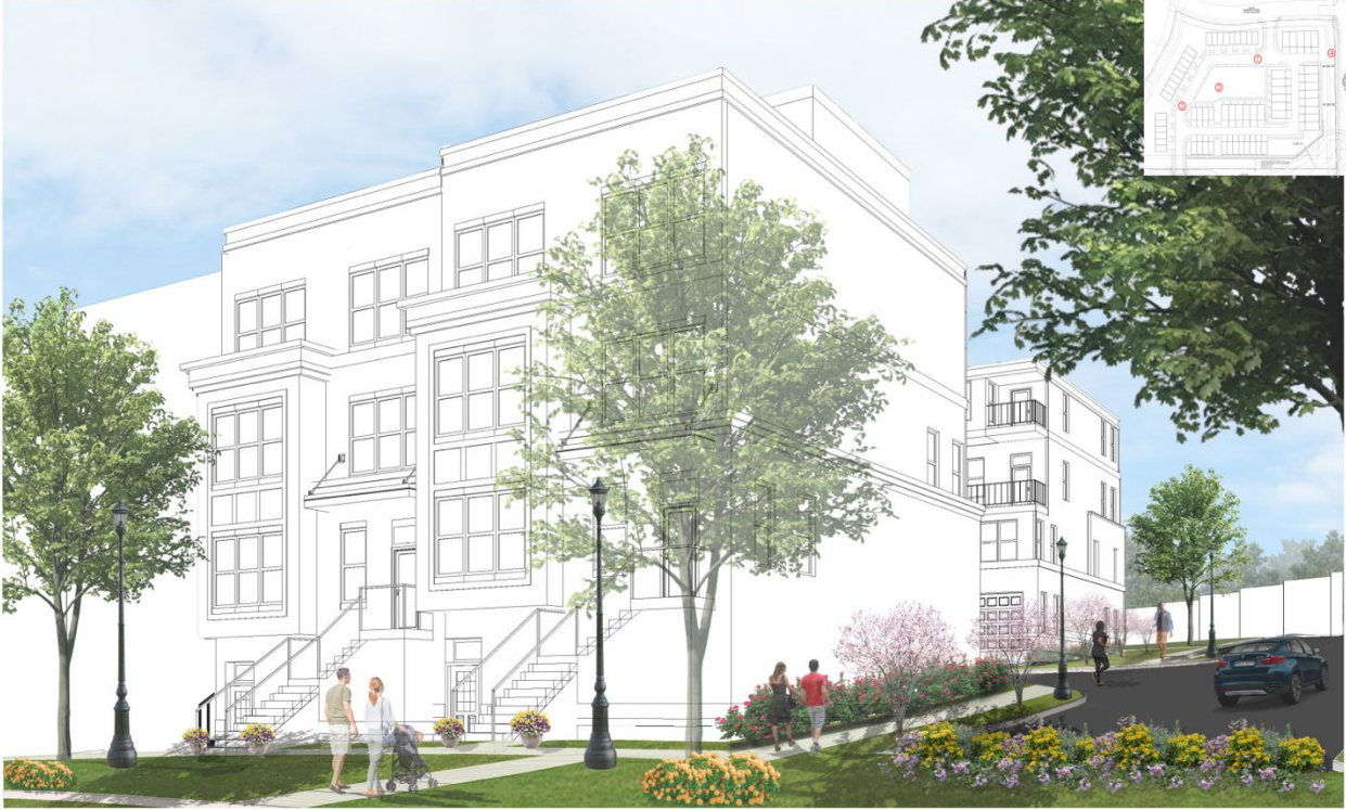
STREET PERSPECTIVE #4