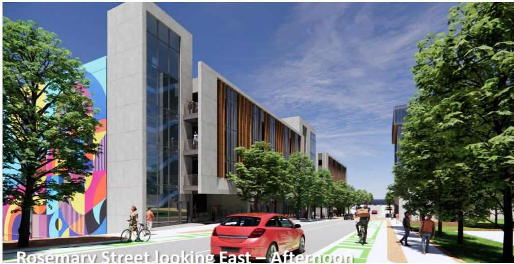
Rosemary Street looking East – Afternoon