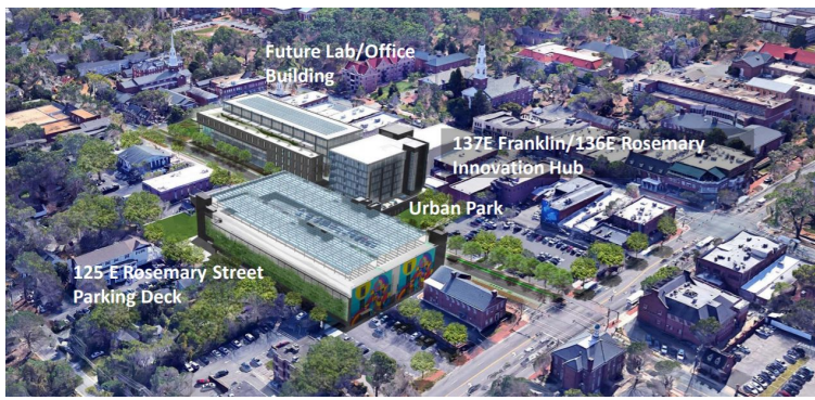
Layout of East Rosemary Street development projects

Derrick Jones of Perkins + Will , one of project architects, said the new and improved deck will add between 200 and 300 spaces to downtown Chapel Hill.