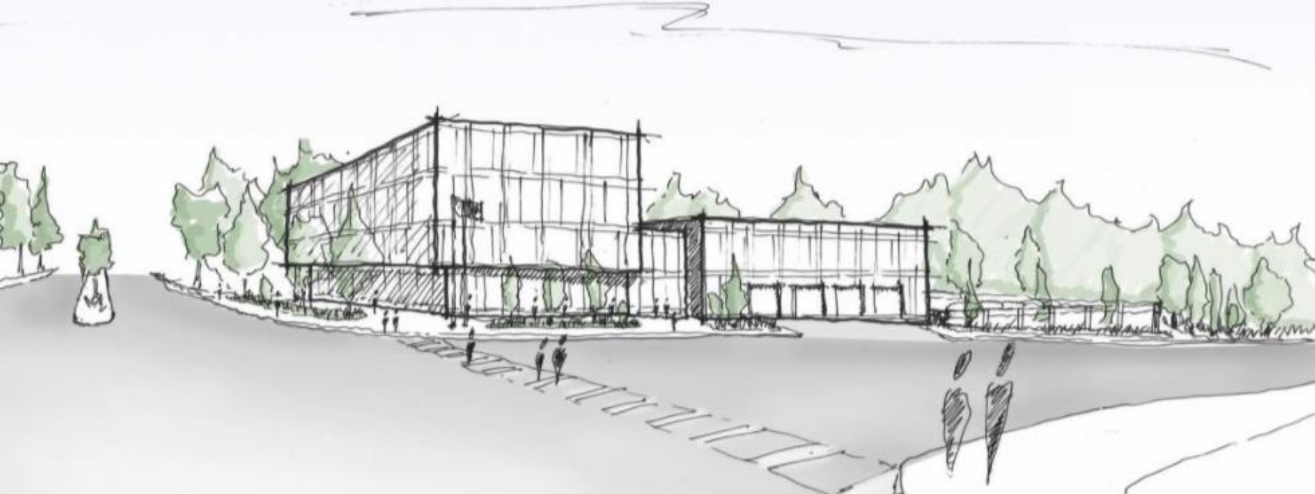
Municipal Services Center