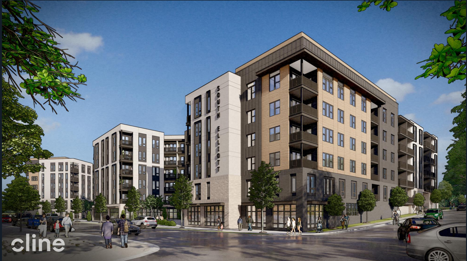
Chapel Hill| Aura South Elliott