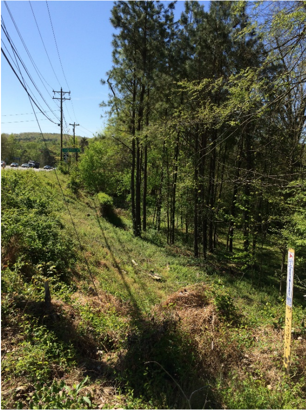
slope from street toward stream in right of way area to be closed