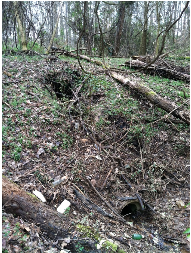
grading over stream bed and piping of stream in right of way area to remain open