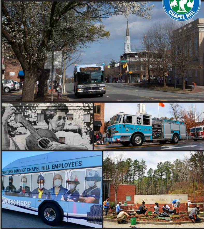
Manager's Recommended Budget FY 2021-22