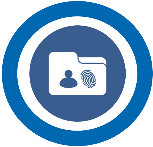
Compromised Sensitive Data