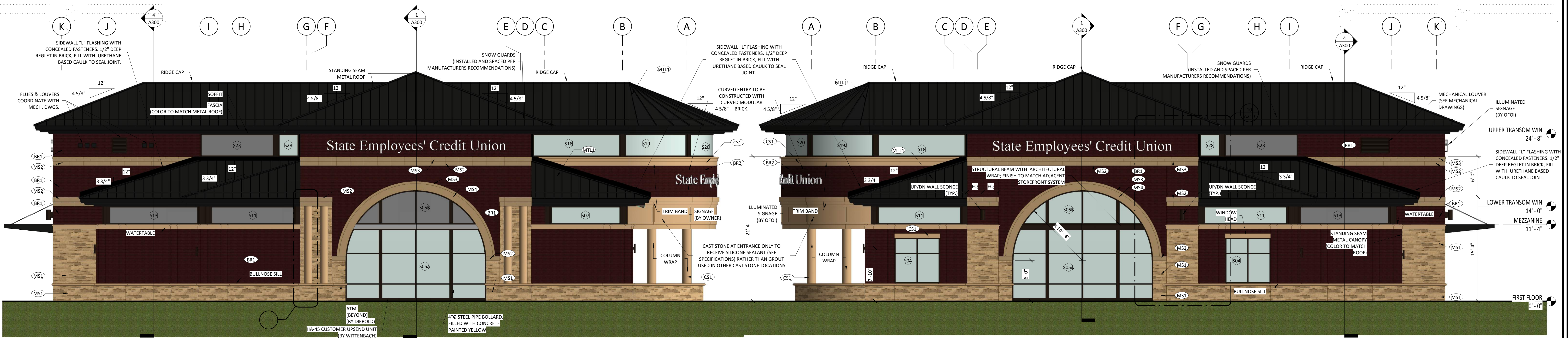
3 LEFT ELEVATION 3/16" = 1'-0"