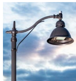
Boston Harbor Arms