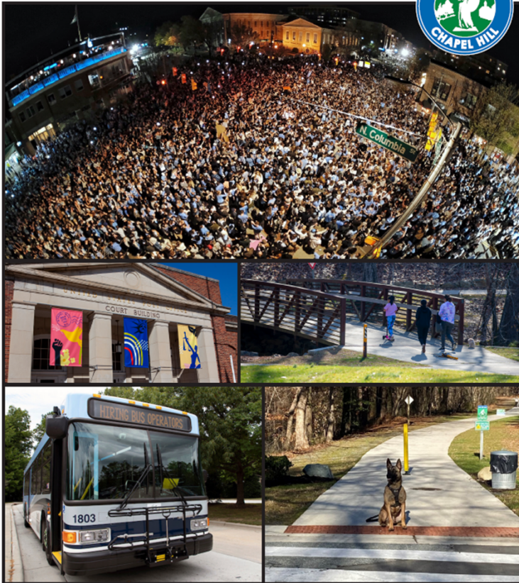
Manager's Recommended Budget FY 2022-23