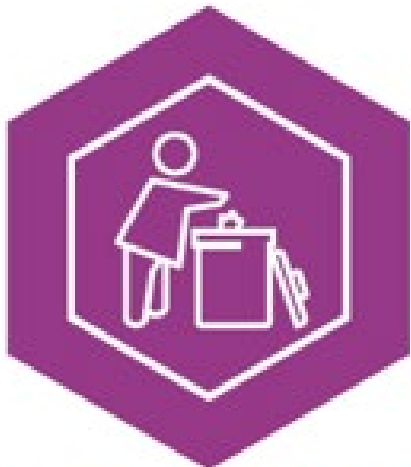
Waste, Water & Natural Resources