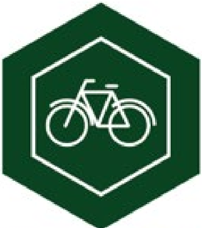
Transportation & Land Use