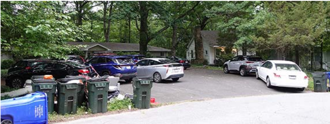
54 Davie Circle

So do not be misled by this flawed study: students want to be close to campus, and we fear what will happen to our family neighborhoods, especially those nearby or on bus lines. Are you sure you want to allow more of these scenes in our neighborhoods?